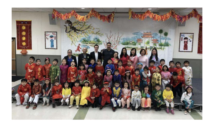
Vietnamese Dual Language Immersion Program Windmill Springs Elementary