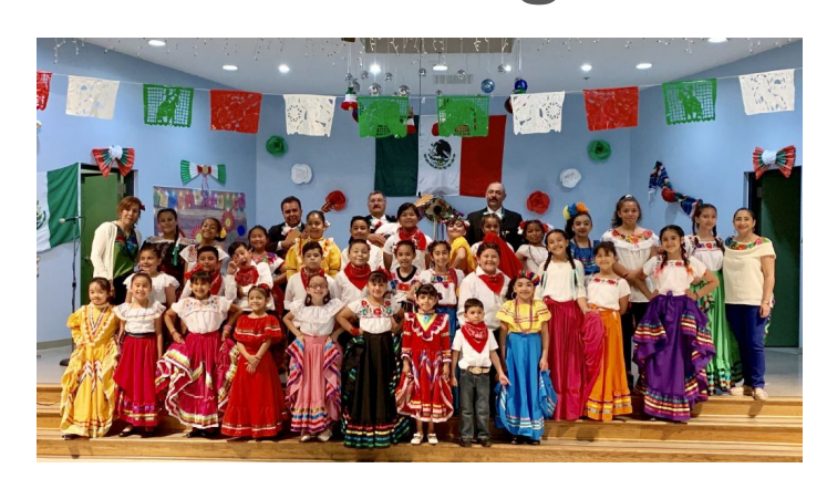
Spanish Dual Language Immersion Program Meadows Elementary