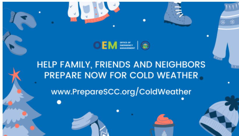
Cold weather safety

For more holiday safety information, visit www.sccfd.org and www.nfpa.org