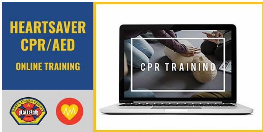
CPR/AED online training

If someone you know stops breathing, do you know what to do? Learn CPR...you can save a life! #SCCFD offers AHA Heartsaver® CPR/AED blended learning course (online learning and in-person skills testing) and includes: