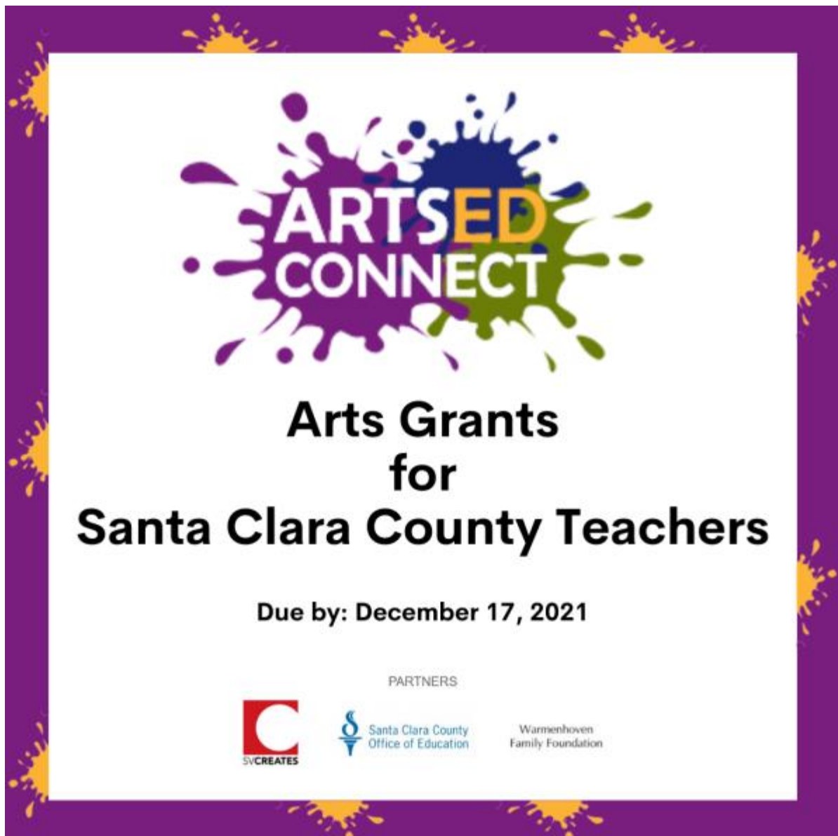
Arts Grants for Santa Clara County Teachers

The Santa Clara County Office of Education (SCCOE) Artspiration department is now accepting grant applications! The SCCOE in partnership with SVCcreates is pleased to announce arts education grants through the generosity of the County of Santa Clara and the Warmenhoven Family Foundation. The ArtsEdConnect program awards grants to classrooms in Santa Clara County to support and encourage arts education in schools.