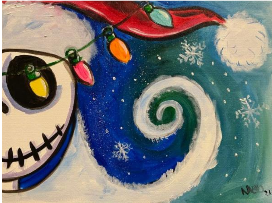
Holiday virtual paint class

The Q Corner has received more new and gently used gc2b binders right in time for the holidays. These chest compression garments are available in half and full length, sizes XS thru 5X. The Team is thrilled to be able to get the binders out to folks in Santa Clara County who otherwise don't have access to one. If you are in our local area and are in need of a binder, click the link to request one: tinyurl.com/qcbinders