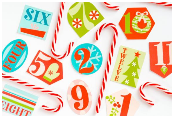
Math Holiday Event

The County's Office of Emergency Management has created a website with advice about how to avoid negative health impacts from the cold. All Santa Clara County libraries (except Campbell Express) are listed as official warming centers during operating hours: www.PrepareSCC.org/ColdWeather .