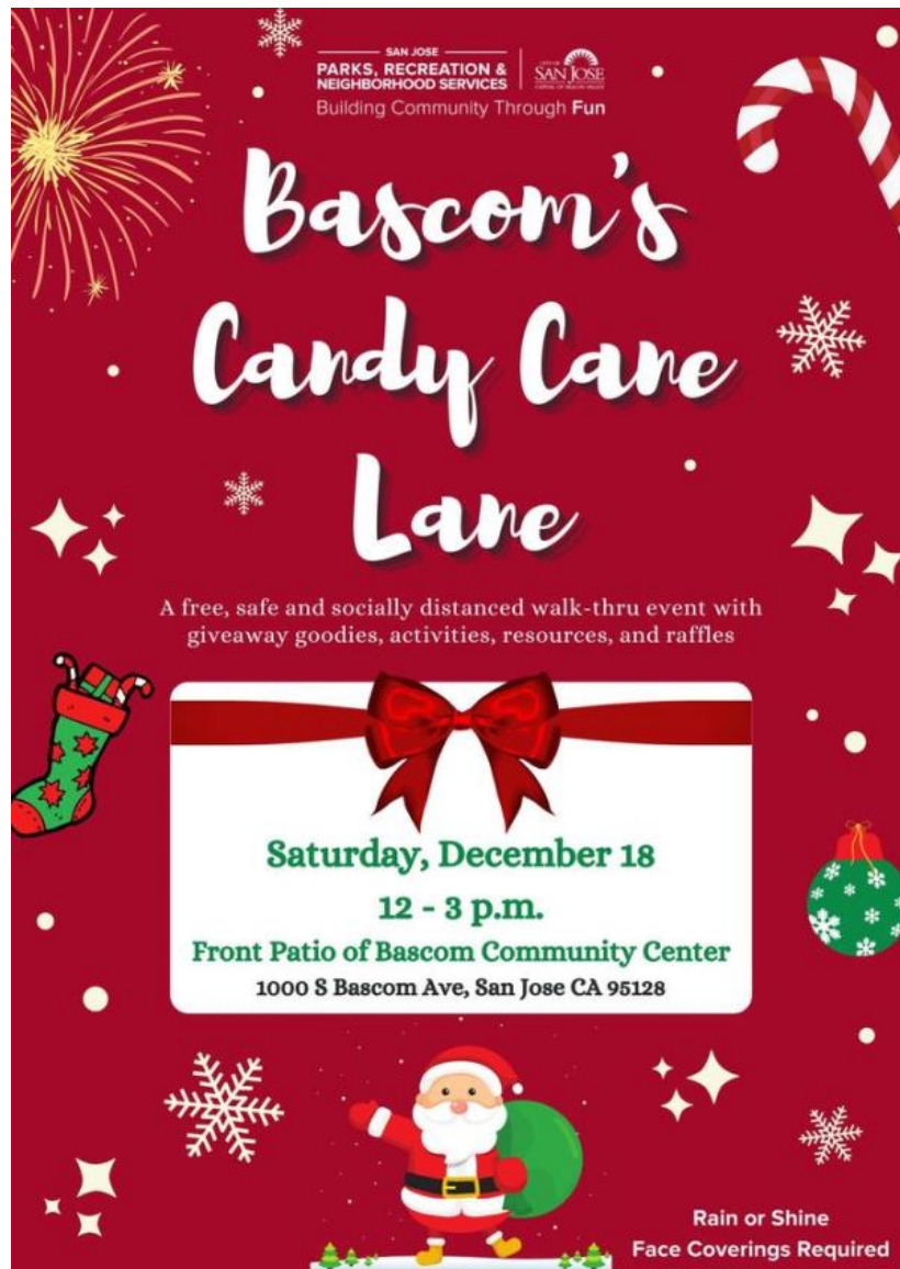
Community event at Bascom Community Center

Families and community members are invited to Bascom's Candy Cane Lane on Saturday, December 18. This is a free, safe and socially distanced walk-thru event with giveaway goodies, activities, resources and raffles! The event is for all ages and abilities.