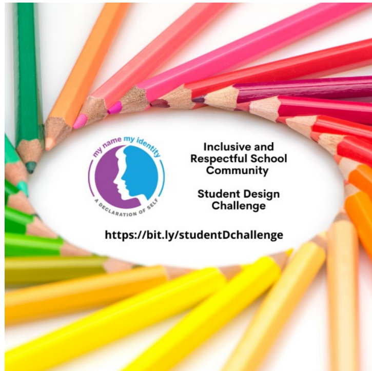
My Name, My Identity Student Design Challenge