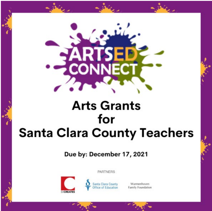
Arts Grants for Santa Clara County Teachers

The Santa Clara County Office of Education (SCCOE) Artspiration department is now accepting grant applications! The SCCOE in partnership with SVCreates is pleased to