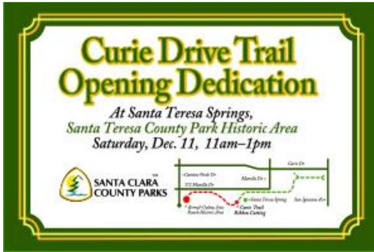
Curie Drive Trail Opening Dedication

Join the Curie Drive Trail ribbon cutting celebration hosted by Santa Clara County Parks and Friends of Santa Teresa on Saturday, December 11 from 11:00 a.m. to 1:00 p.m.