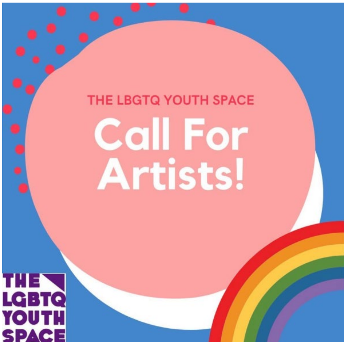
LGBTQ Youth Space Call for Artists!

The submission deadline is February 25, 2022. Eligibility, Key Dates, and Submission requirements can be found on the Artspiration website - https://www.sccoe.org/arts/yas .