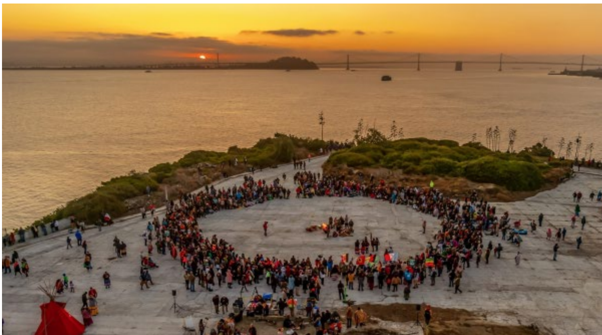
Indigenous Peoples Thanksgiving Sunrise Gathering