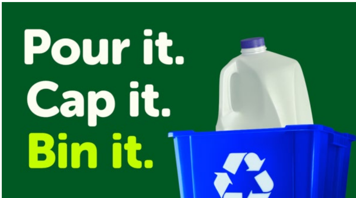
Pour it. Cap it. Bin it. Campaign

California Milk Advisory Board Urges Californians to 'Recycle the Jug' in Public Information Campaign . Visit RecycletheJug.com for more information on how you drive sustainable behavior change.