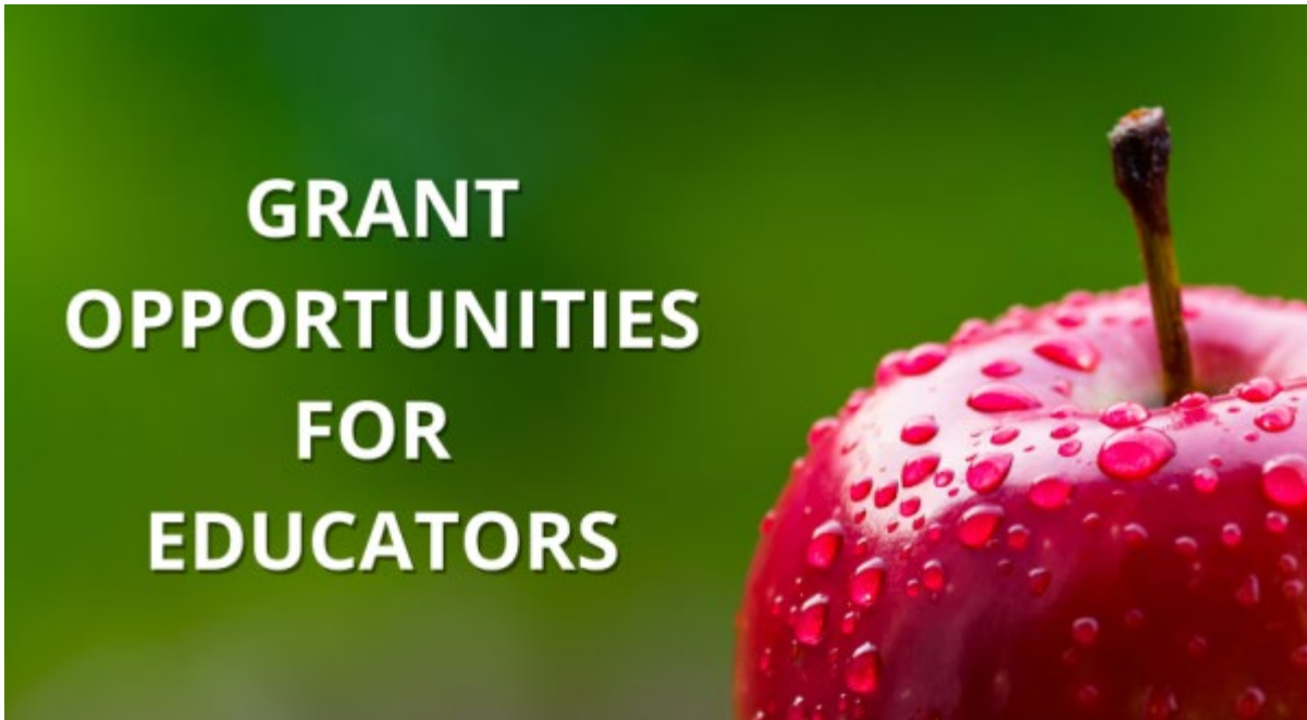
Click the Picture for Available Grants