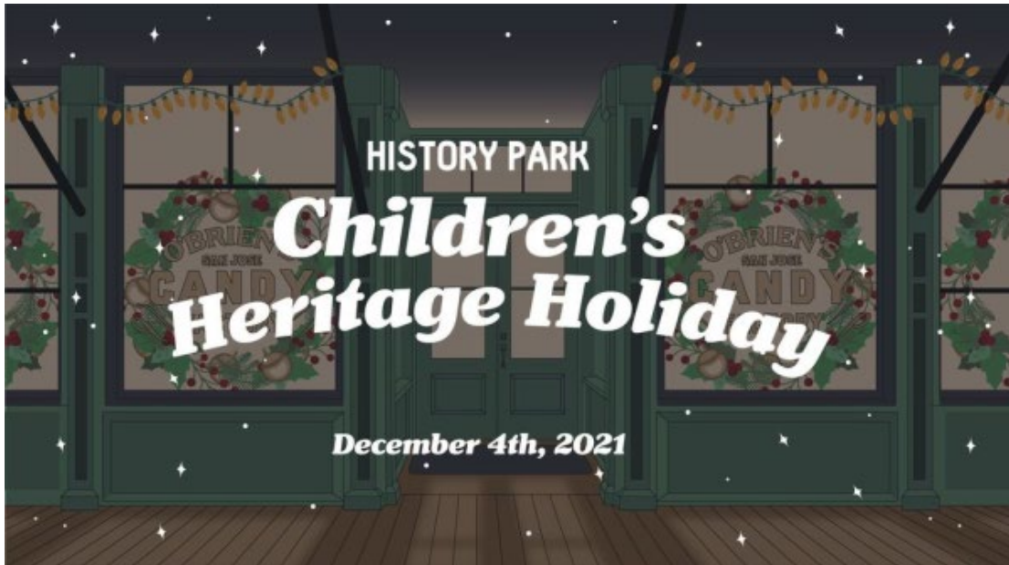
Children's Holiday at History Park

The Bascom Branch of the San Jose Public Library will hold outdoor Family Storytime Thursdays at 10:30am. Capacity is limited; stop by the info desk 30 minutes before it begins to get your ticket. For a complete list of storytimes, visit sjpl.org/Storytime .