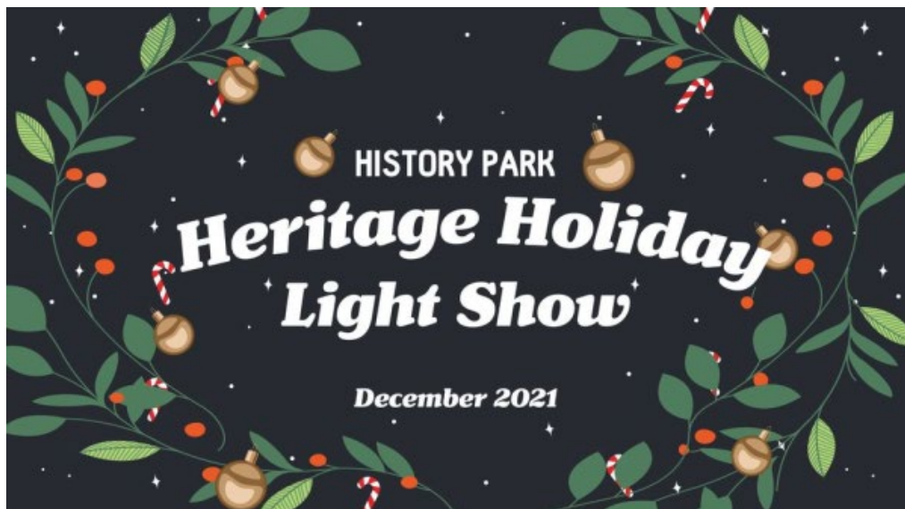
Light Show: December 3-5

*There is a fee associated with this event