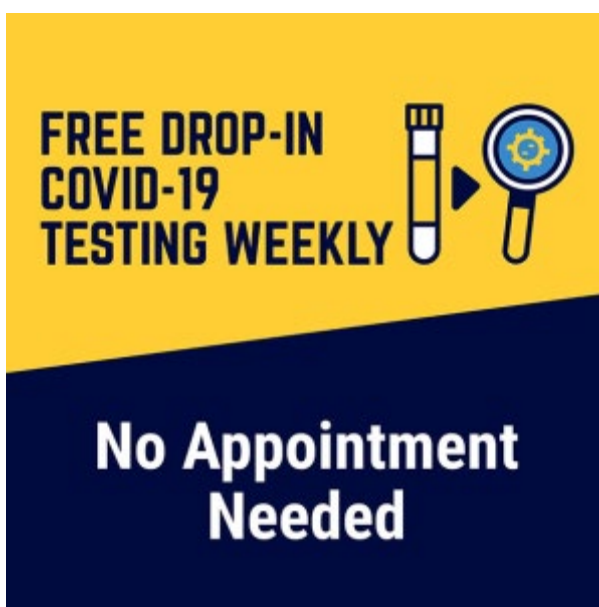
COVID-19 Testing at Ridder Park

She's nearly ready for school. All that's left is to get vaccinated for COVID-19.