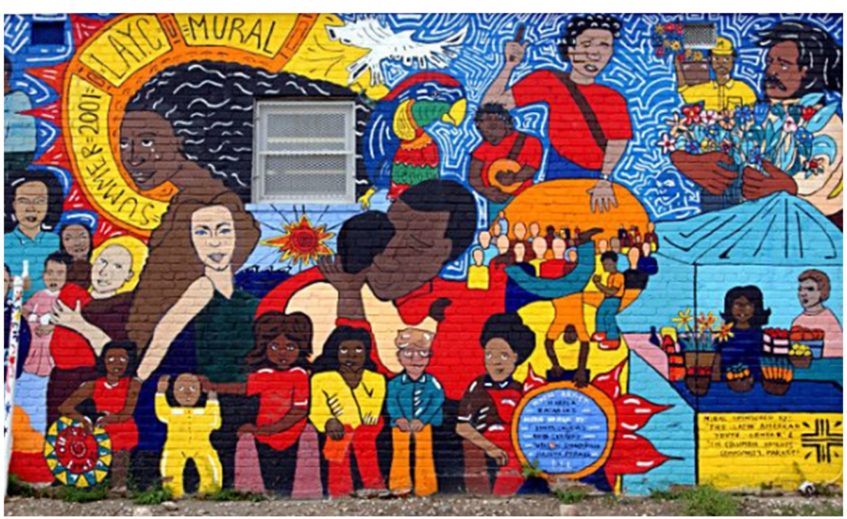
Hispanic Heritage Month

Celebrate Hispanic Heritage Month! Recognize the achievements and contributions of Hispanic American champions who have inspired others to achieve success. Discover documents, exhibits, films, blog posts and more from the National Archives and Presidential Libraries that highlight Hispanic culture.