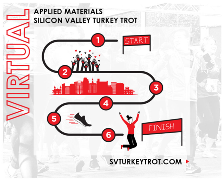
Silicon Valley Turkey Trot

It's that time of year, again! Registration for the Silicon Valley Turkey Trot is open! Visit https://runsignup.com/Race/CA/SanJose/SiliconValleyTurkeyTrot.