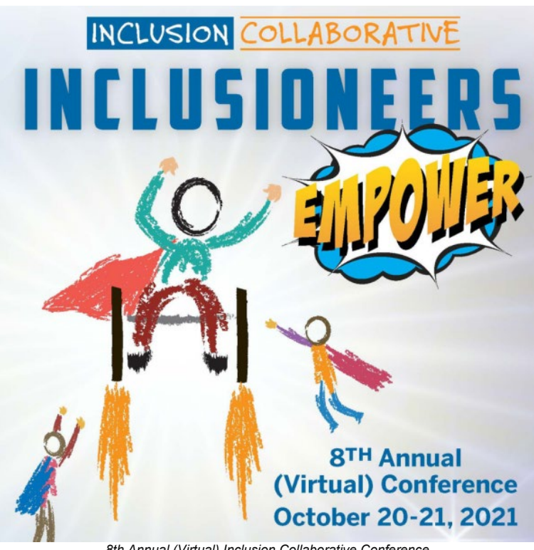
8th Annual (Virtual) Inclusion Collaborative Conference