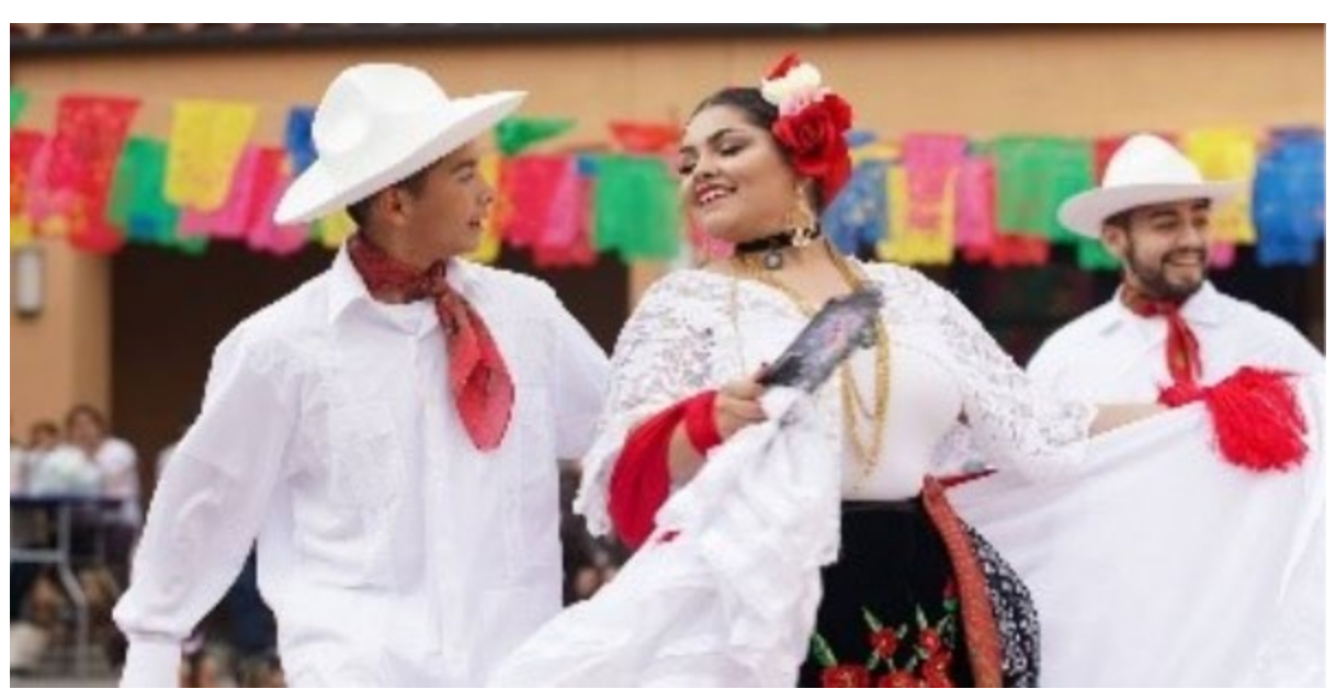
Lupeños and Los Lupeños Juvenil

For more detailed information about individual preparedness, review the preparedness one-pager prepared by the SCCOE's Emergency Preparedness – School Safety & Security Administrator - https://sccoe.to/8b9e3b.