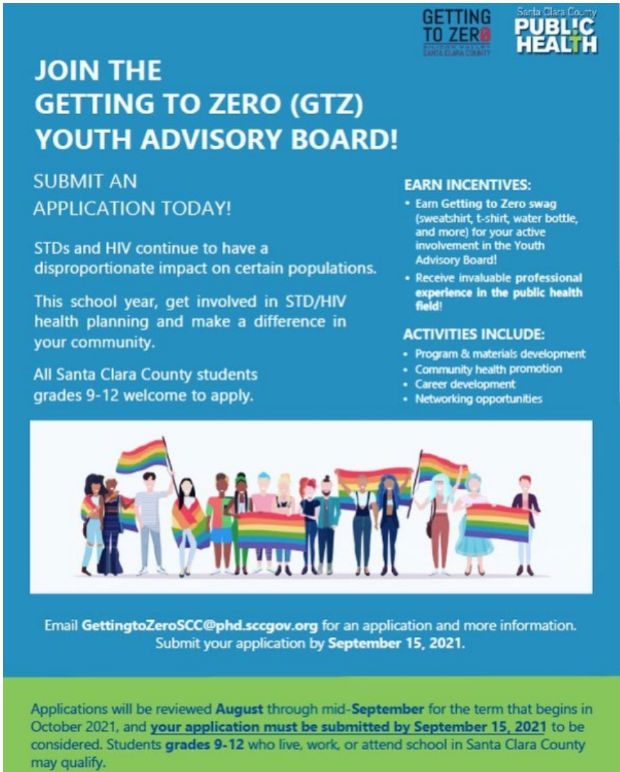
Getting to Zero