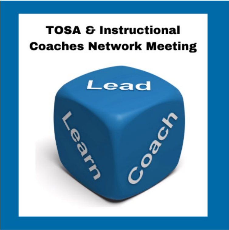
TOSA & Instructional Coaches Network Meeting