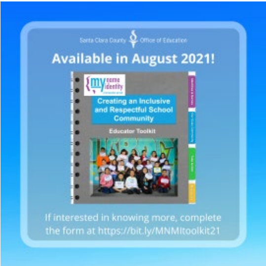
MNMI Toolkit Information