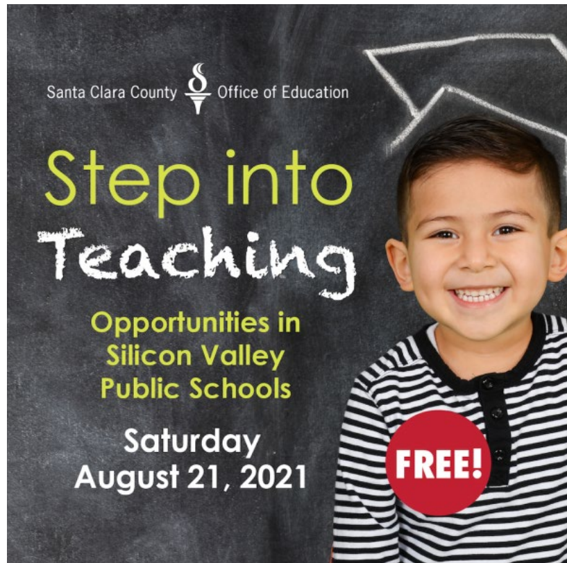
Step into Teaching

Join the SCCOE's Virtual Step into Teaching: Opportunities in Silicon Valley Public Schools Event to help learn and prepare for the joys of a teaching career.