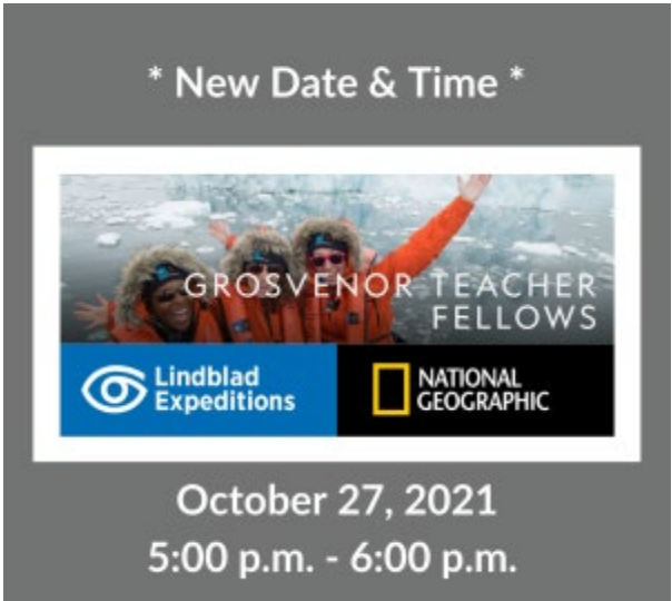
2021 Grosvenor Teacher Fellows Recognition