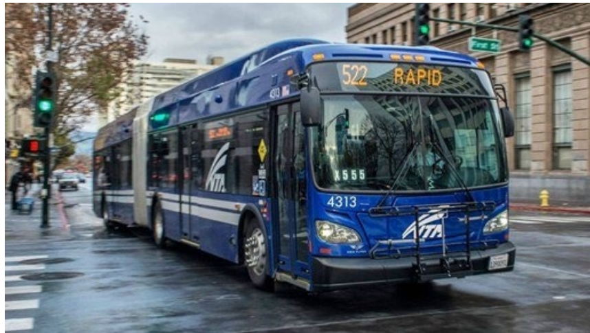
VTA Citizens Advisory Committee

Join the Santa Clara County Library District on Saturday, August 14 for an engaging panel discussion about women innovators. Register for this special virtual event: https://bit.ly/3y1eK6u .