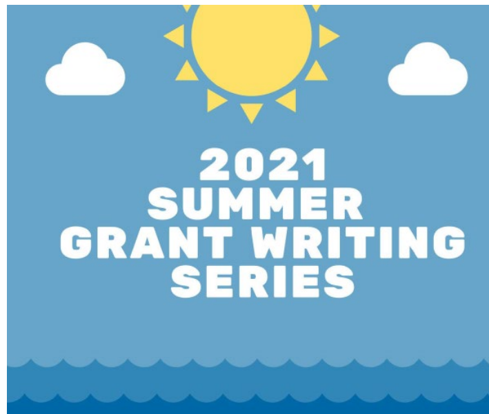
Grant Writing Workshops

SantaClara4kids is an online family resource guide, run by local parents for local parents within the Santa Clara County. From Events, Arts & Music, Birthday Parties, Camps, Child Care, Classes, Deals & Discounts, Schools, Field Trips, Health Providers, Kids Eat Free venues, Places To Go, Sports, and for Special Needs children, it's an easy to use online directory listing where you can find an array of resources for your kids. For more information, visit https://santaclara4kids.com/ .