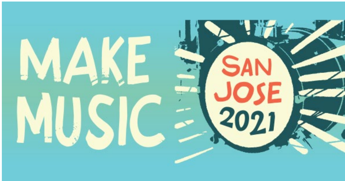
Make Music, San Jose 2021

Make Music San Jose is a free community-curated celebration of music held on the summer solstice, June 21. This year's celebration will be a hybrid, with online and in-person performances. Visit www.MakeMusicDay.org/SanJose to watch and listen to performances throughout the City on June 21.