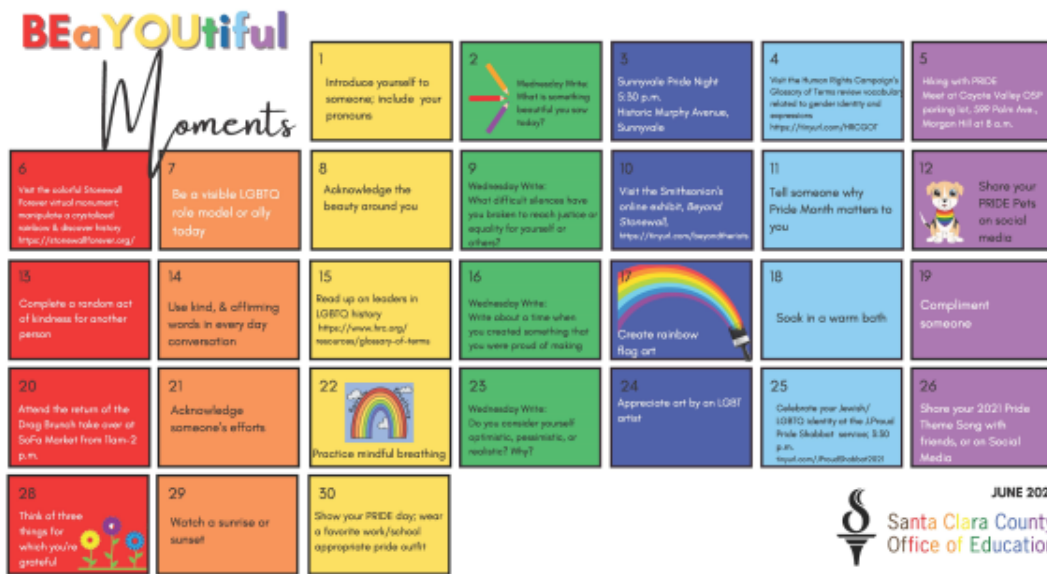
BEaYOUtiful LGBTQ Moments Calendar

Join the SCCOE in 30 days of BEaYOUtiful LGBTQ moments during Pride month. To access the calendar, visit tinyurl.com/SCCOEPride2021