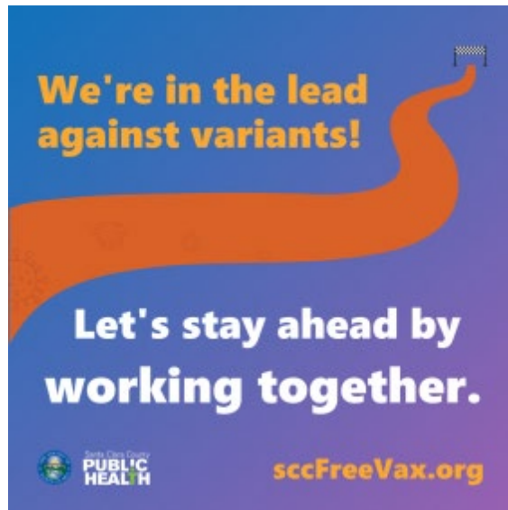
Keep the lead on these variants