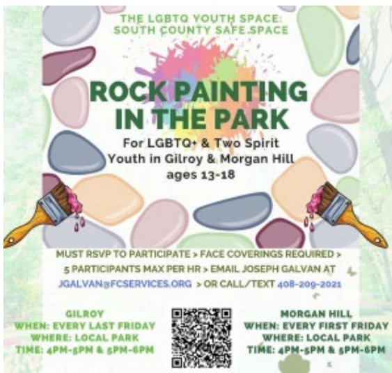
Outdoor Rock Painting