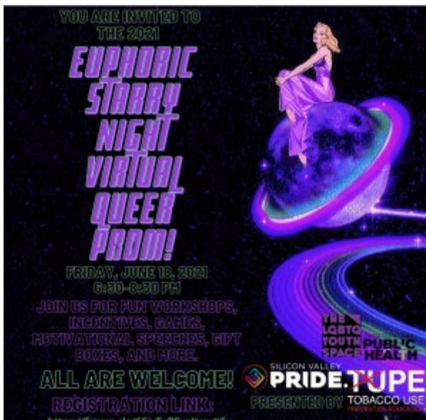
"Euphoric Starry Nights" Queer Prom

August 5, 2021, 12:00-12:30 p.m.: https://na.eventscloud.com/grantbudget2021