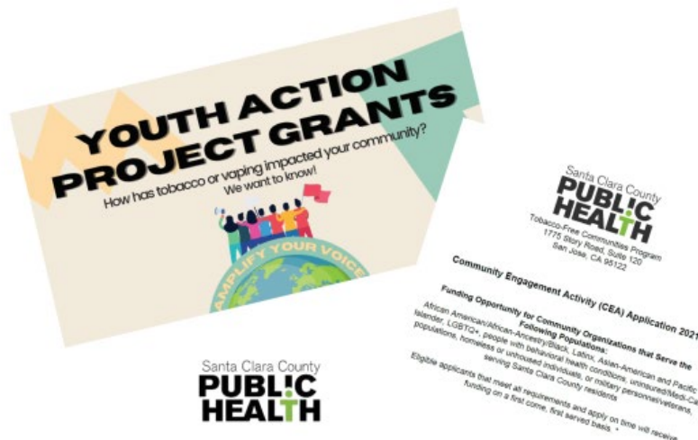
Youth Action Project Grants