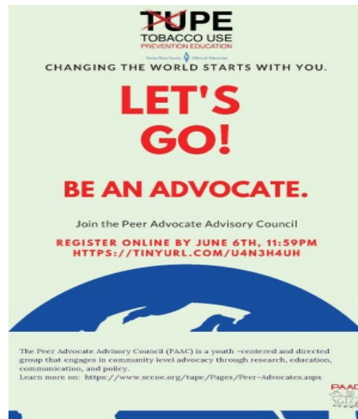
Peer Advocate Advisory Council (PAAC)