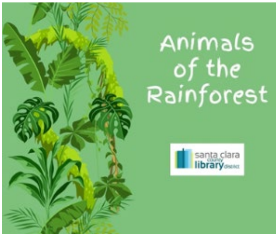
Animals of the Rainforest

Join the Santa Clara County Library District - SCCLD for a Summer Reading program, June 2 at 3 p.m.