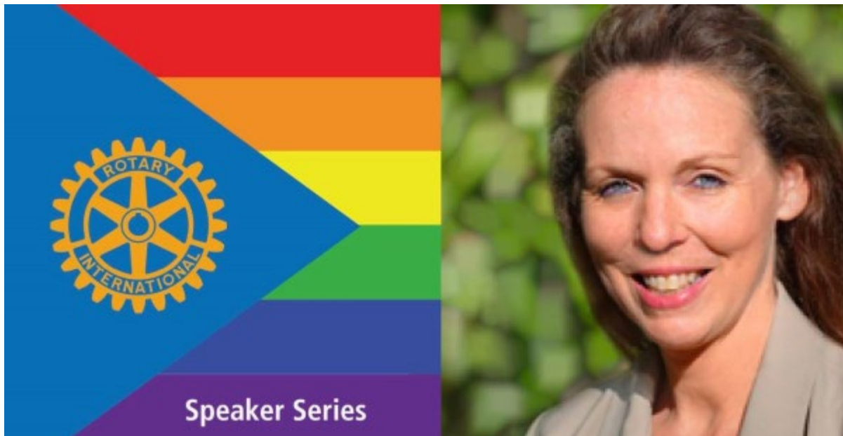
Silicon Valley Rainbow Rotary Speaker Series

Register for this free Zoom event: https://bit.ly/2R3FQtp