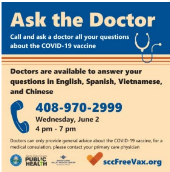
Ask the Doctor