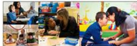
English Learners with Disabilities Community of Practice