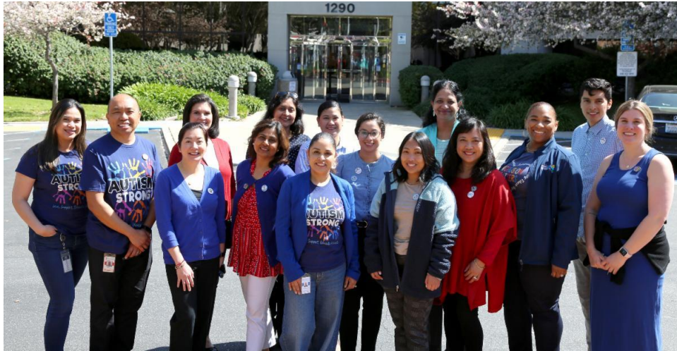
Autism Awareness Month

SCCOE staff gathered to recognize Autism Acceptance Month ahead of the annual recognition.