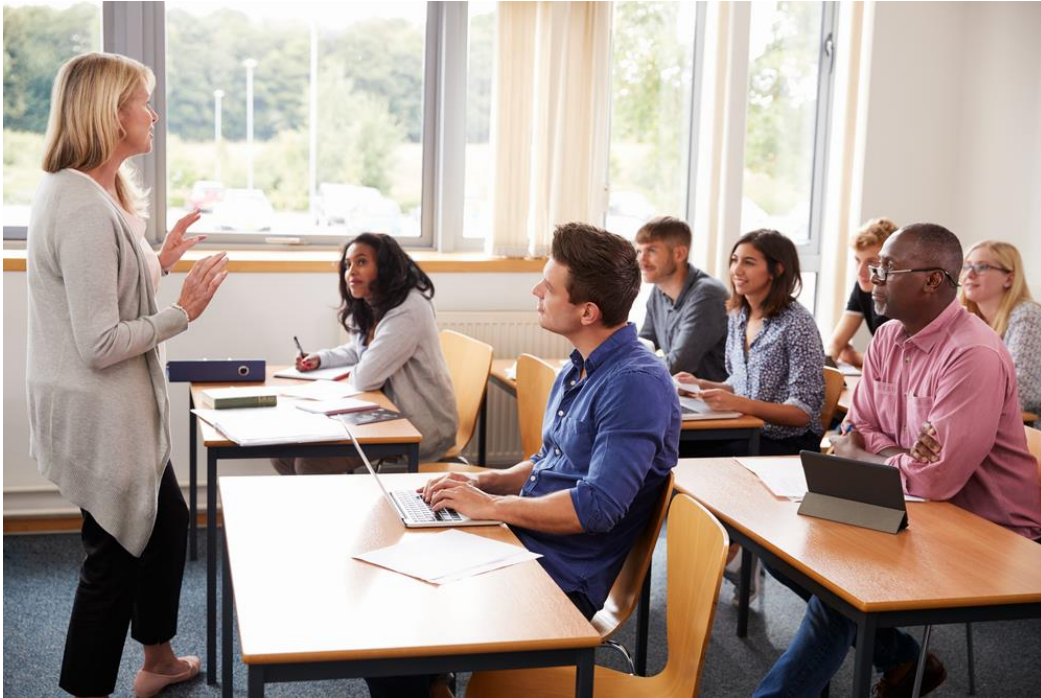
Free English as a Second Language (ESL) Classes

SOMOS Mayfair, Alum Rock School District, and Evergreen Community College are working together to bring tuition-free college classes to the Chavez Family Resource Center this year. The last day to register is April 4. To register, visit: https://forms.gle/7nyL828sjhJLb9u1A