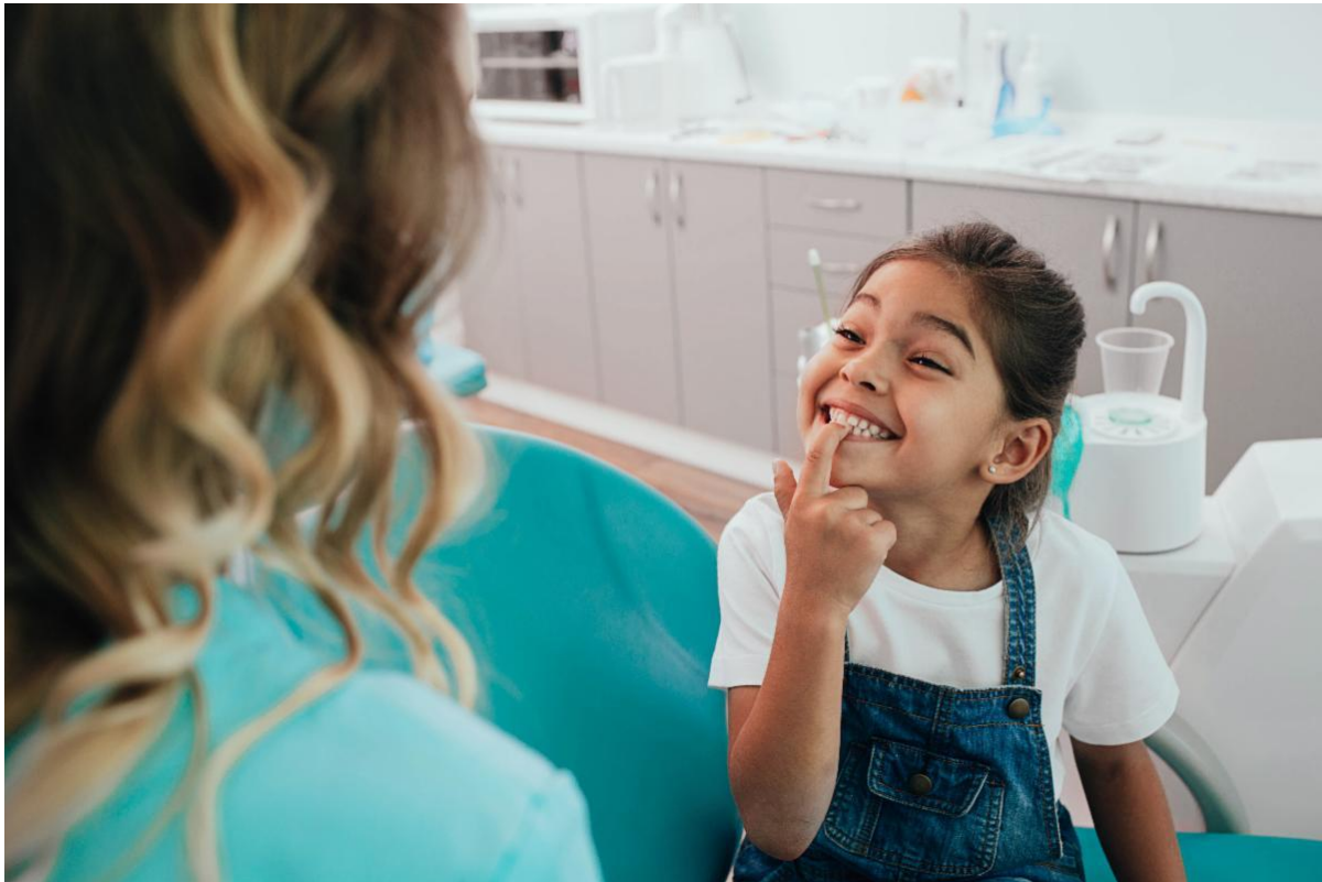
National Children's Dental Health Month

*There is a cost associated with some trainings.