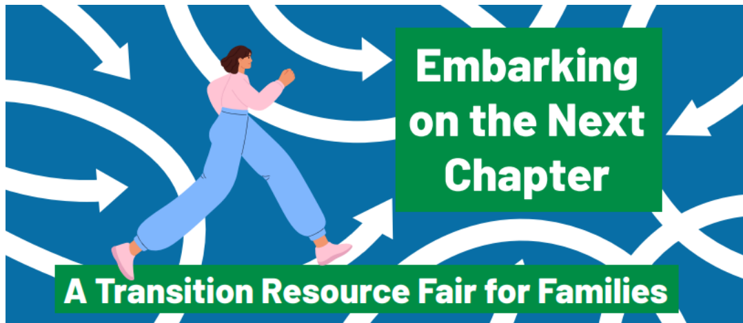
Workability Program Resource Fair