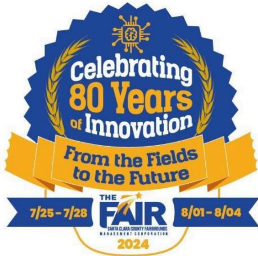
Santa Clara County Fair 80th Year Celebration Poster Competition

The Santa Clara County Fair is celebrating 80 years and is requesting schools to submit student artwork to be considered for the poster competition. The theme is “Celebrating 80 Years of Innovation, from the Fields to the Future”.