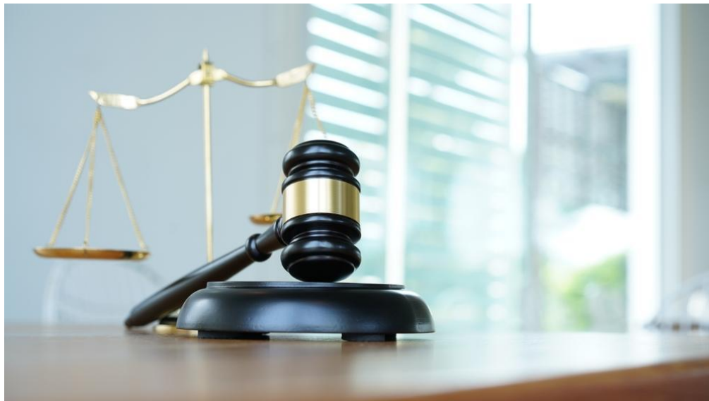
Civil Grand Jury

To learn more about the Special Education Program, visit: https://sccoe.to/SpecialEducationDept