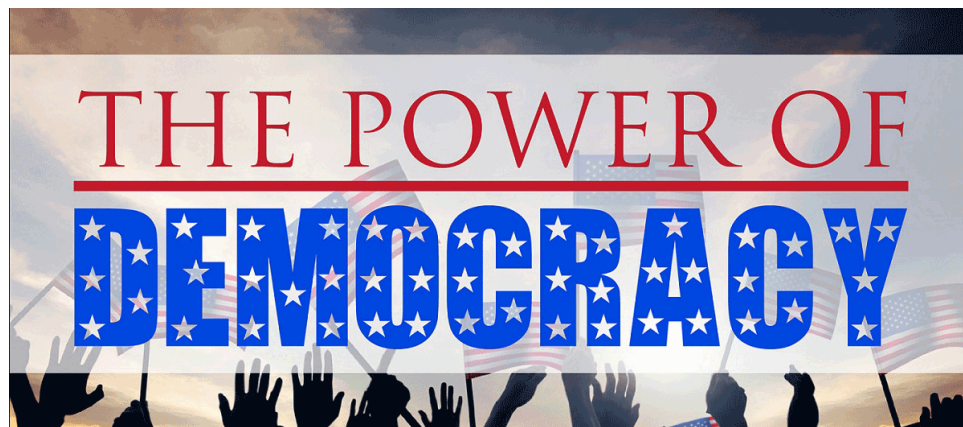
State Seal of Civic Engagement Educator Awards

To learn more or register, visit: https://sccoe.to/SVRCareerFair2024