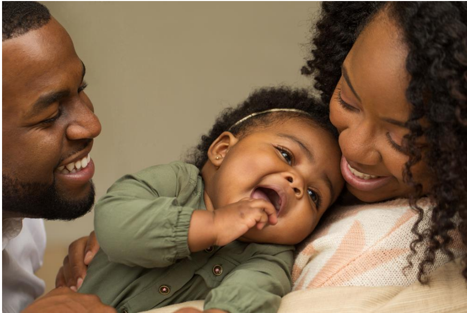
Black Infant Health Program

The County of Santa Clara Black Infant Health (BIH) Program has served the county since 1991. This program empowers pregnant and parenting African American mothers through assisting them in accessing the appropriate resources for health during pregnancy and beyond.