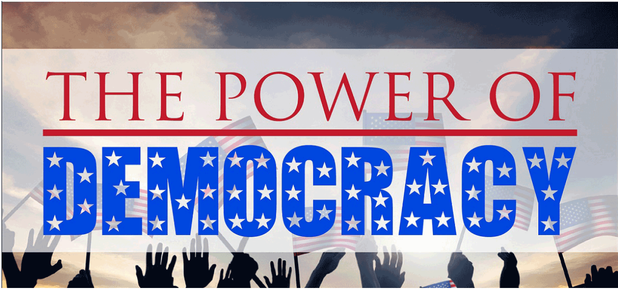
Santa Clara County Community Champion Award

The Santa Clara County Office of Education would like to recognize students in our county who are working to make a difference in the community. Each high school may nominate one student to receive the Santa Clara County Community Champion Award. Please submit your student's name and a brief summary of their accomplishments by March 8, 11:59 PM. All students who meet the criteria will receive a certificate and (4) students in the county will be selected to receive their award in person on April 24, 2024.