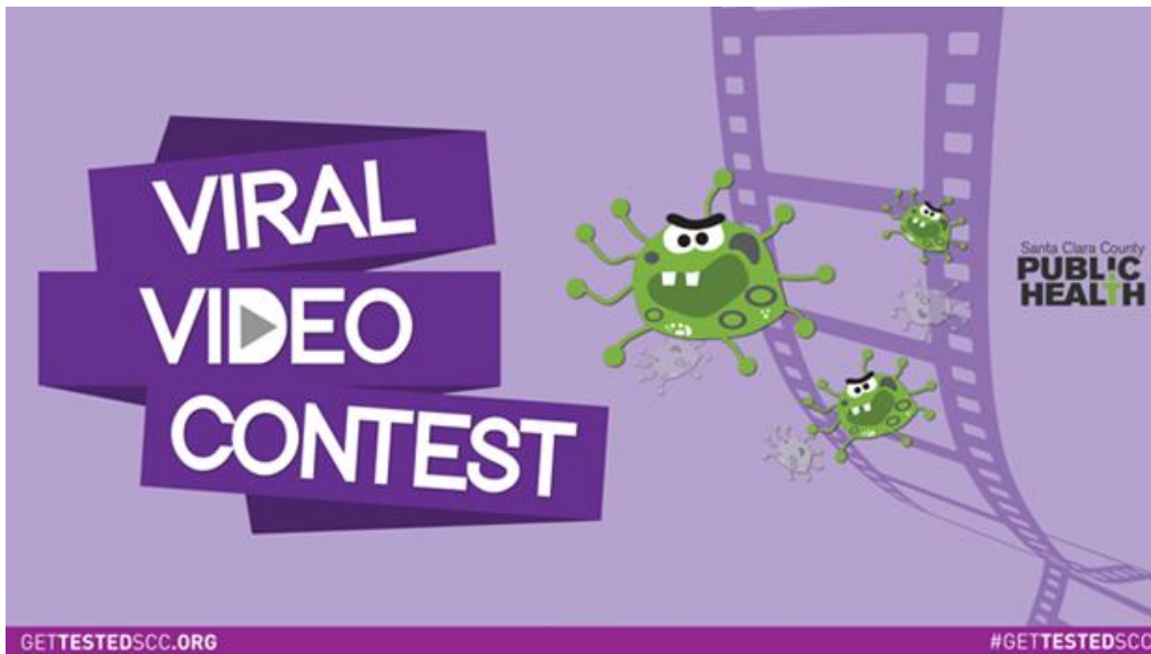
Viral Video Contest

The County of Santa Clara Public Health Department's Sexual Health & Harm Reduction Program is happy to announce the launch of the 2024 Viral Video Contest for Santa Clara County high school-age youth. Santa Clara County high school students are encouraged to address this staggering statistic by creating a short video (30-90 seconds) that addresses the stigma around STIs and testing, encourages safer sexual practices, and promotes healthy relationships. Winning students will be awarded up to $1,500 for themselves and $500 for their high school. The submission deadline is March 8.