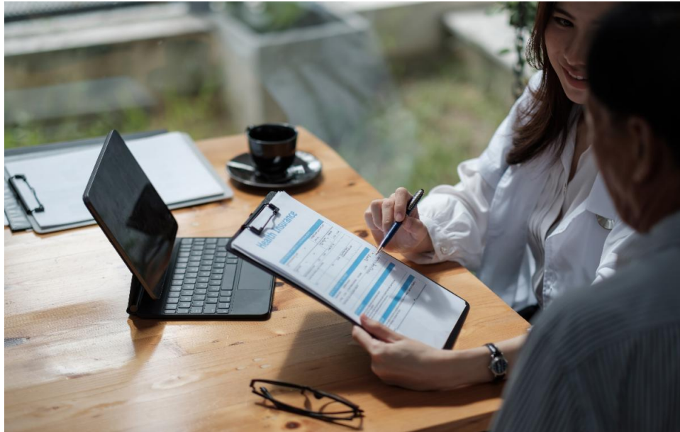
Statewide School-based Billing Professional Learning Network

The SCCOE invites school-based billing coordinators and other LEA staff involved or interested in school-based billing to join their virtual learning network. In this monthly session, attendees can gain insight about different programs and billing models, understand the steps to develop and implement a school-based billing program, and more.