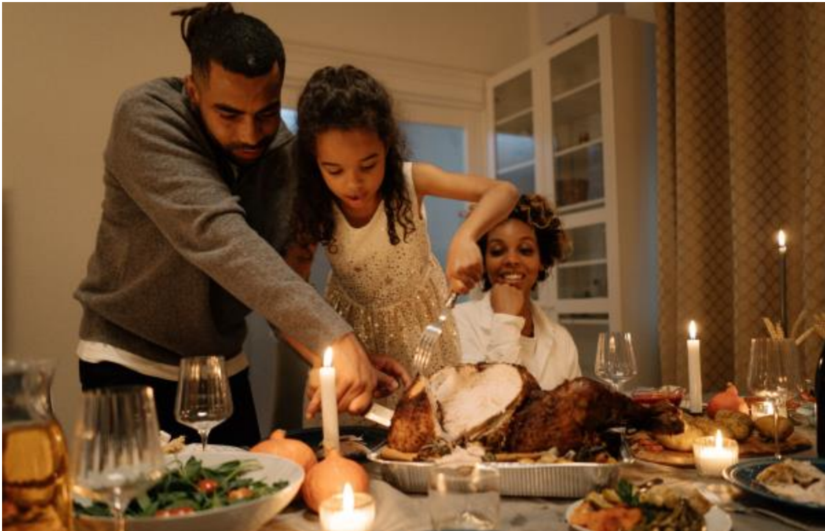
Holiday Cooking Safety

Kitchens are often the heart of every home, especially during the holidays. Safety in the kitchen is important when there is a lot of activity. Learn more about how you can keep yourself and your family safe during holiday cooking by visiting bit.ly/scCFiresafety .