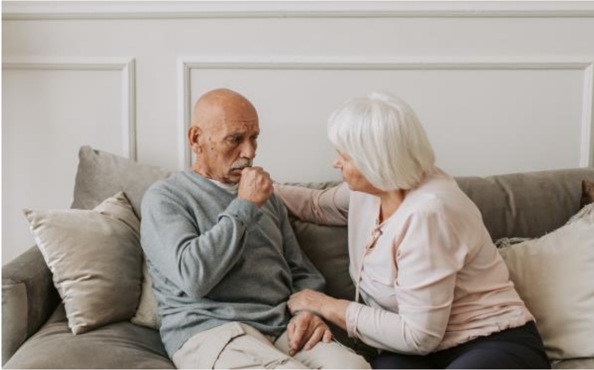
Winter Health and Wellness

Feeling under the weather? It could be COVID-19 or the flu. Stay home and away from others. Get tested, and consult with your doctor if you feel any symptoms like a fever, cough, shortness of breath, fatigue, sore throat, and/or loss of taste or smell. For information about testing, visit https://covid19.ca.gov/get-tested