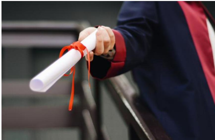
Scholarship applications are open

The eQuality Scholarship Collaborative is accepting applications for the 2023 eQuality Scholarships.