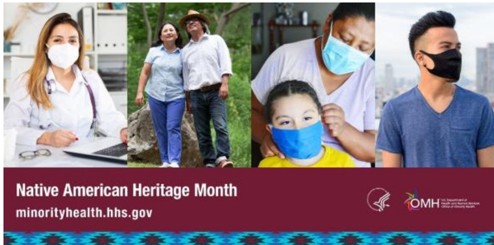
Health and wellness resources

For more information, visit https://www.scvmc.org/patients-visitors/services/medassist-program