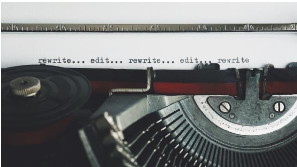
National Novel Writing Month

If you're participating in National Novel Writing month this year, here are some resources from the Santa Clara County Library District: