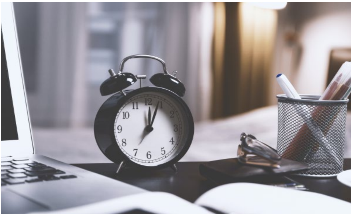
Daylight Savings Ends

Daylight Savings ends on Sunday, November 6, at 2 a.m. Set clocks back one hour on Saturday, November 5, 2022, before going to bed.