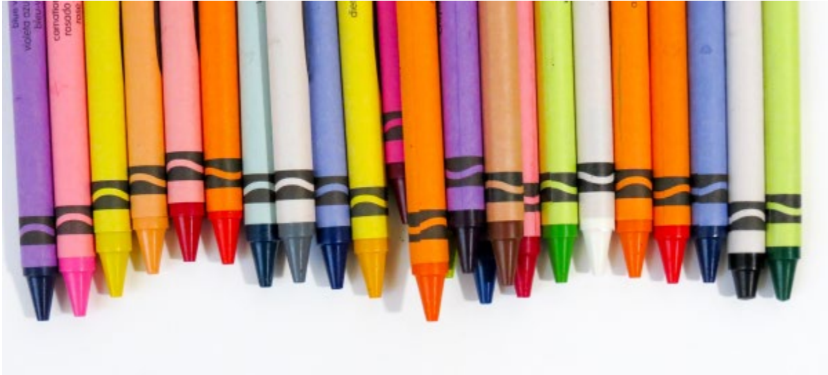
Free coloring pages

For more details, send an email to healthydev@sjsu.edu or visit https://www.sjsu.edu/hdcc/events/index.php