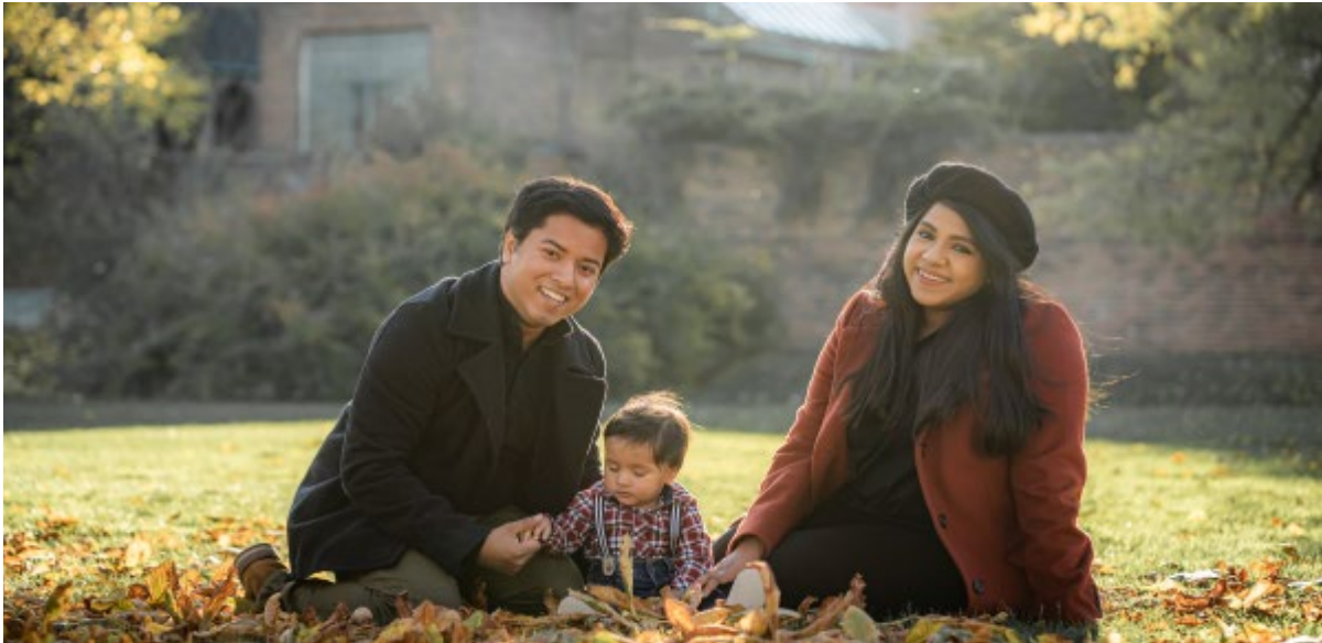
Strategies for a healthy fall

As the days get shorter and cooler and the seasons change, use these strategies from the CDC to help prevent chronic diseases and maintain a healthy lifestyle.