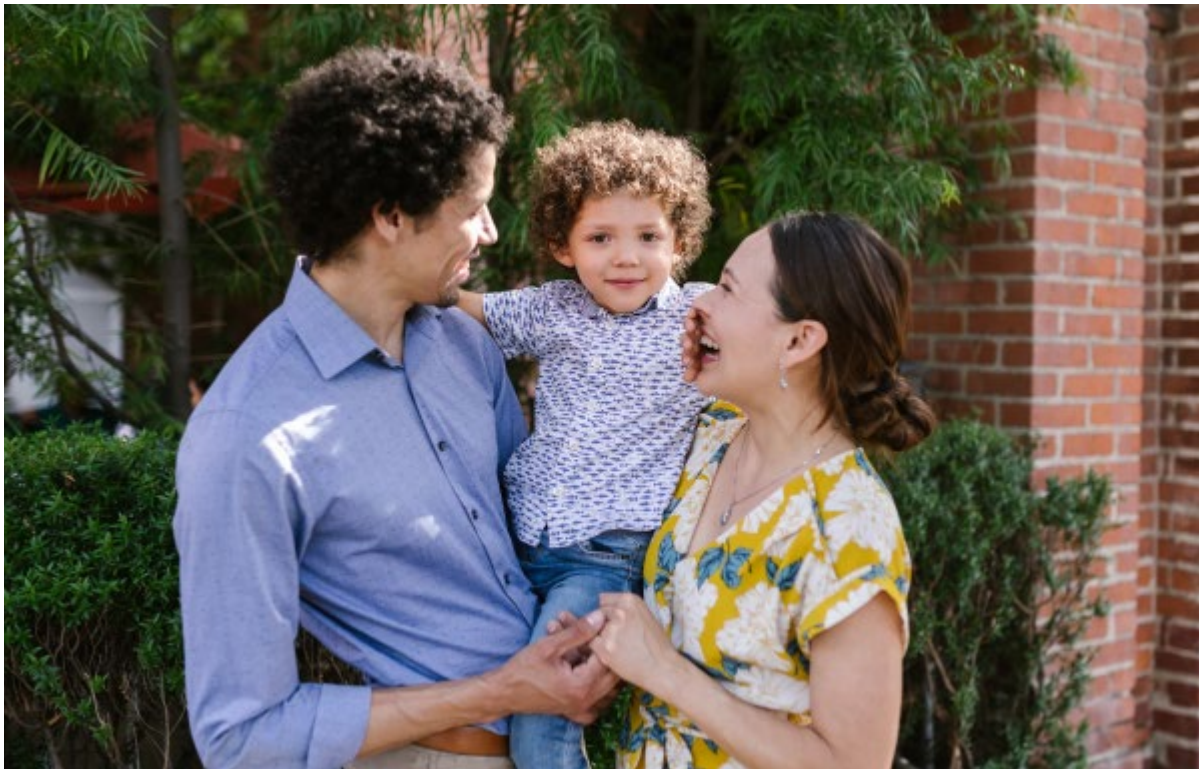
Weekly Parent Talks

Open to parents and caregivers, the Parent Talks series provide advice and informational resources about parenting. The series is on Wednesdays at 12 p.m. on Zoom and in person at the Healthy Development Community Clinic, located at Oak Grove High School in Building H2.