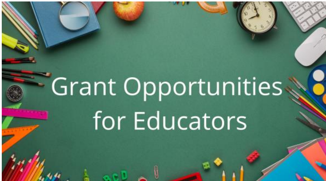
October Grant Opportunities

ONE Archives Foundation has partnered with the UCLA History-Geography Project to host Professional Learning Symposiums and provide LGBTQ history lesson plans for educators at no cost. The lesson plans comply with California's FAIR Education Act, which requires California K–12 schools to integrate fair, accurate, inclusive and respectful representations of the LGBTQ community and people with disabilities into their social studies and history classes.