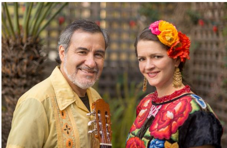
Hispanic Heritage Month at Saratoga Library