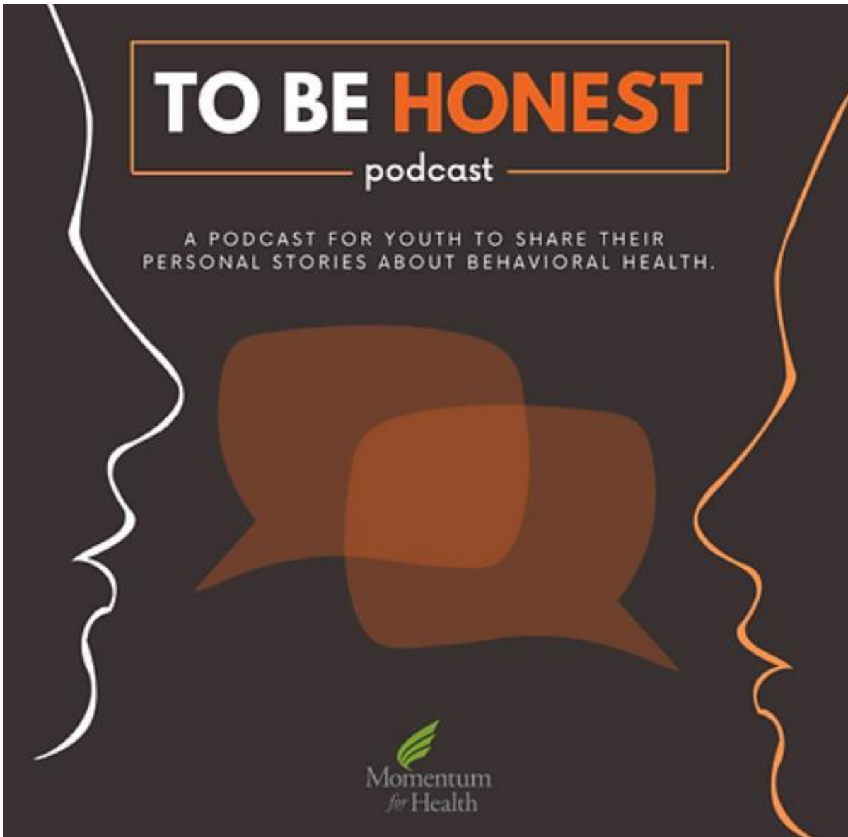
TO BE HONEST podcast