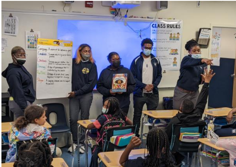
Rhizome Student Fellowship

Calling high school students! Are you interested in civic engagement? Rhizome's 2022-2023 Cohort is looking for student leaders to organize campus fellowships. Rhizome provides nonpartisan resources, training, and community spaces for youth leaders to engage in civic education through peer mentorship.