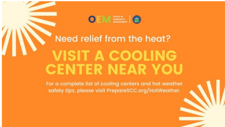
Relief from the heat