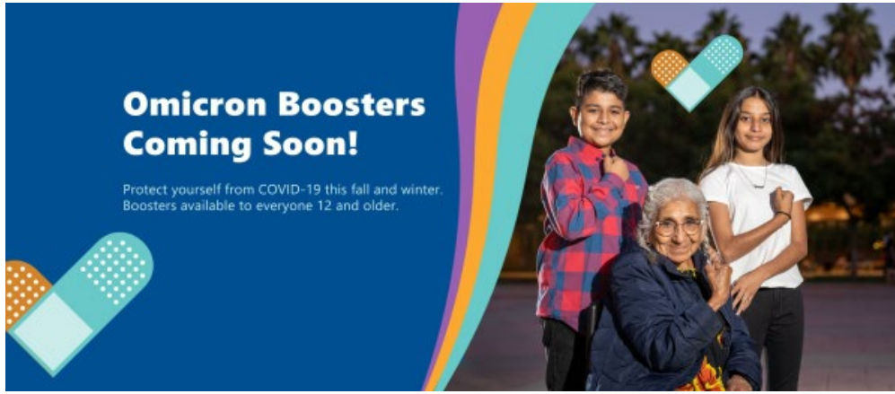
Boosters coming soon!

Bivalent COVID-19 vaccine boosters for individuals ages 12 years and up are coming soon!