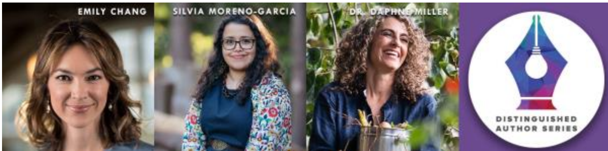
Distinguished Authors Series 2022

The Santa Clara County Library District (SCCLD) is proud to announce the third annual Distinguished Author Series starts in September. SCCLD welcomes three writers whose works spark thought-provoking ideas and conversations about topics ranging from the future of tech, to the connections between health, food and agriculture, to the works of a genre-jumping, bestselling author. Each of these barrier-breaking authors comes from a different and diverse background, with stories that will captivate and inspire.