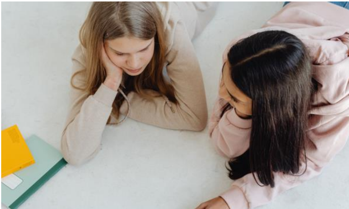
Kognito Friend2Friend Module