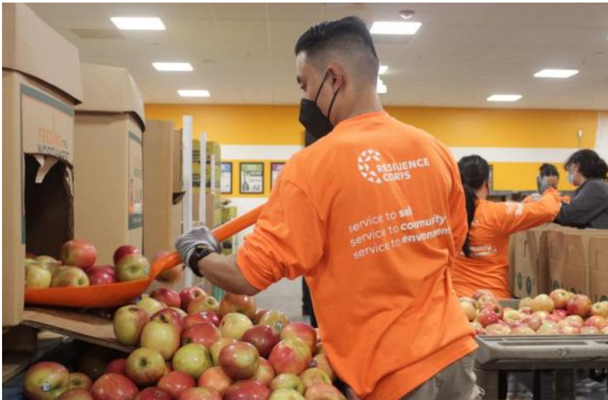
Paid Job Training

Calling all young adults, the Resilience Corps is currently recruiting! Work up to 1,200 hours of paid job training and graduate with placement in a career or educational track, a solid network of connections, and certifications that will help your budding career. Talk to a recruiter today: recruitment@sjcccs.org | (669)220-4822