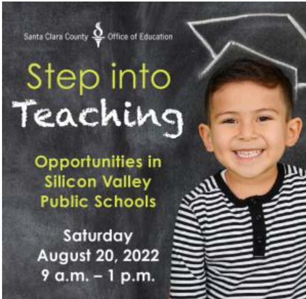
Step Into Teaching