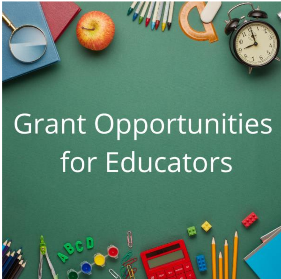
Grants for Educators

Bring the science of everyday life into your classroom with these custom teacher resources that will keep your students entertained, engaged and working towards exciting new science solutions. The 3M Young Scientist Lab in partnership with Discovery Education has science resources for teachers.