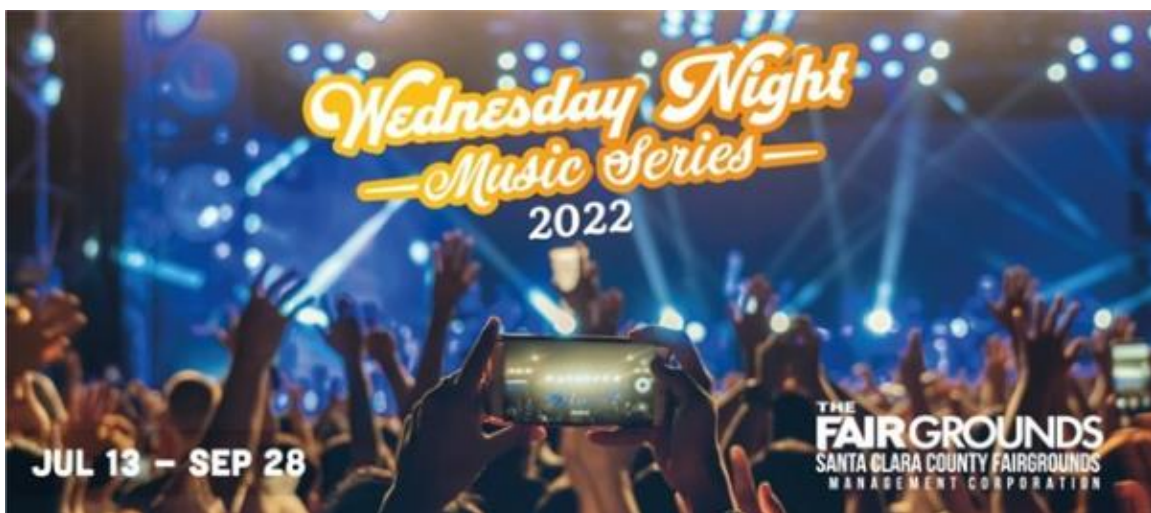
Free Music Series

Register for the free series by visiting the SCCLD Distinguished Author Series .