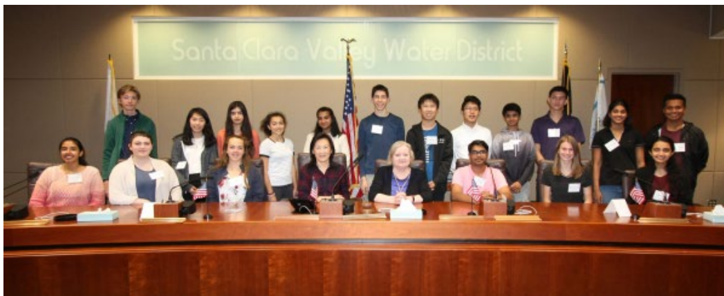
Valley Water Youth Commission

Fire agencies throughout Santa Clara County have partnered to remind residents that fireworks are illegal, dangerous and can result in fires and injuries that are easily preventable. Fines will be issued to anyone using, possessing, storing, or selling illegal fireworks. Santa Clara County's 'social host' Fireworks Ordinance holds property owners responsible for the illegal use of fireworks on their property.