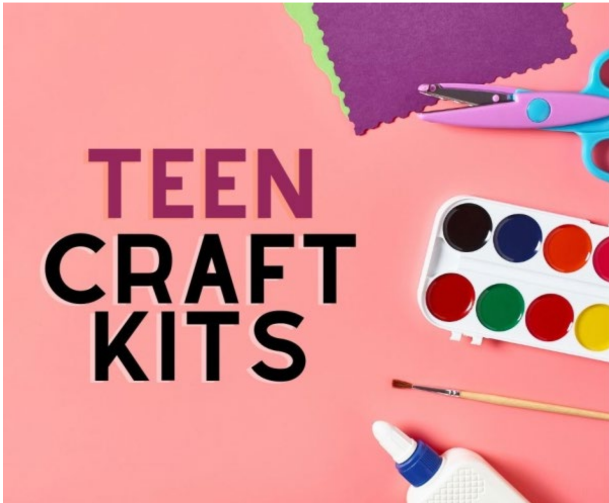
SCCLD Kits for Teens

This summer, the Santa Clara County Library District Teen Services Librarians will be giving out weekly Grab & Go Craft bags to local teens. Each bag will feature a different craft with instructions and supplies included. All bags will be handed out on a first come, first served basis and for patrons ages 13-18.