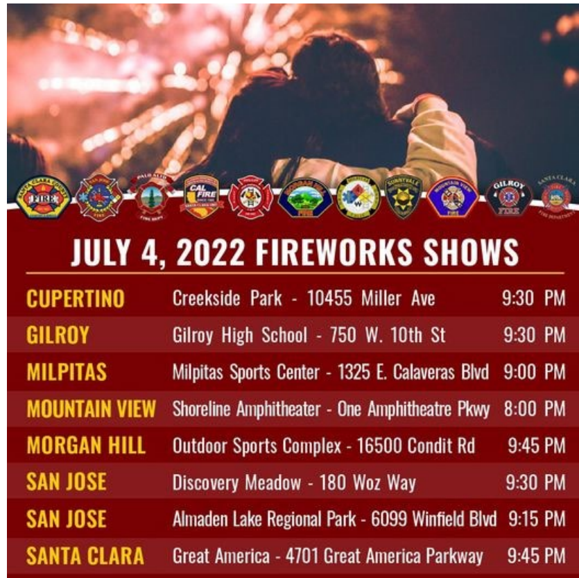
Fireworks Shows in Santa Clara County

Fire agencies throughout Santa Clara County have partnered to remind residents that fireworks are illegal, dangerous and can result in fires and injuries that are easily preventable. Fines will be issued to anyone using, possessing, storing, or selling illegal fireworks. Santa Clara County's 'social host' Fireworks Ordinance holds property owners responsible for the illegal use of fireworks on their property.