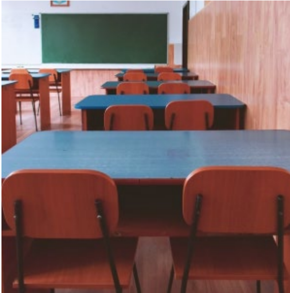
Empty school desks

The Santa Clara County Office of Education and the Santa Clara County District Attorney's Office will be hosting the 2022-2023 Santa Clara County Attendance Collaborative to discuss best practices, hear from colleagues about best practices in their districts, hear policy updates, discuss CARE court, and more. The first meeting will be on Tuesday, August 2 at 10 a.m. Please register at https://na.eventscloud.com/693275 For more information, send an email to youthwellness@sccoe.org .