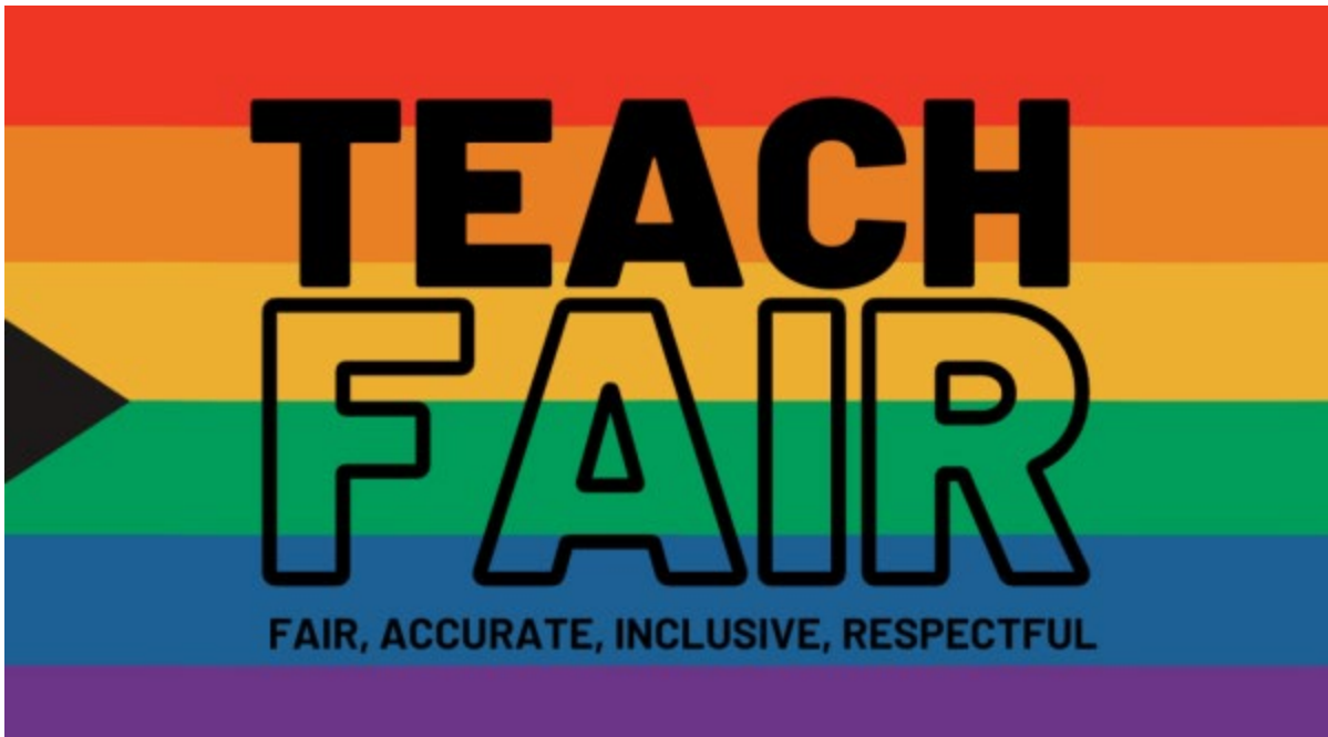
Fair Act Resource Blog Post