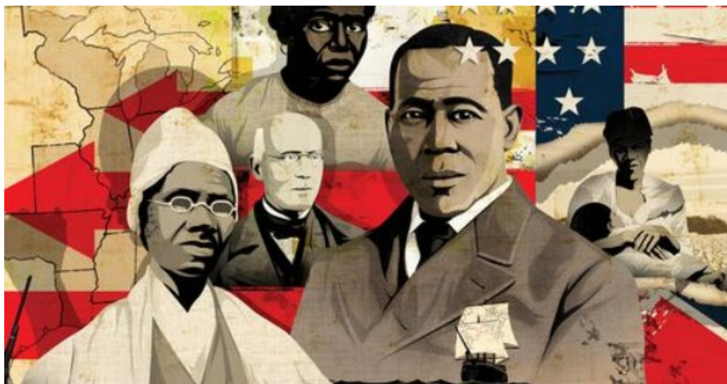
Learning For Justice (LFJ) Teaching Hard History Fall 2022 Cohorts

Applications are live for Learning For Justice (LFJ) Teaching Hard History Fall 2022 Cohorts!