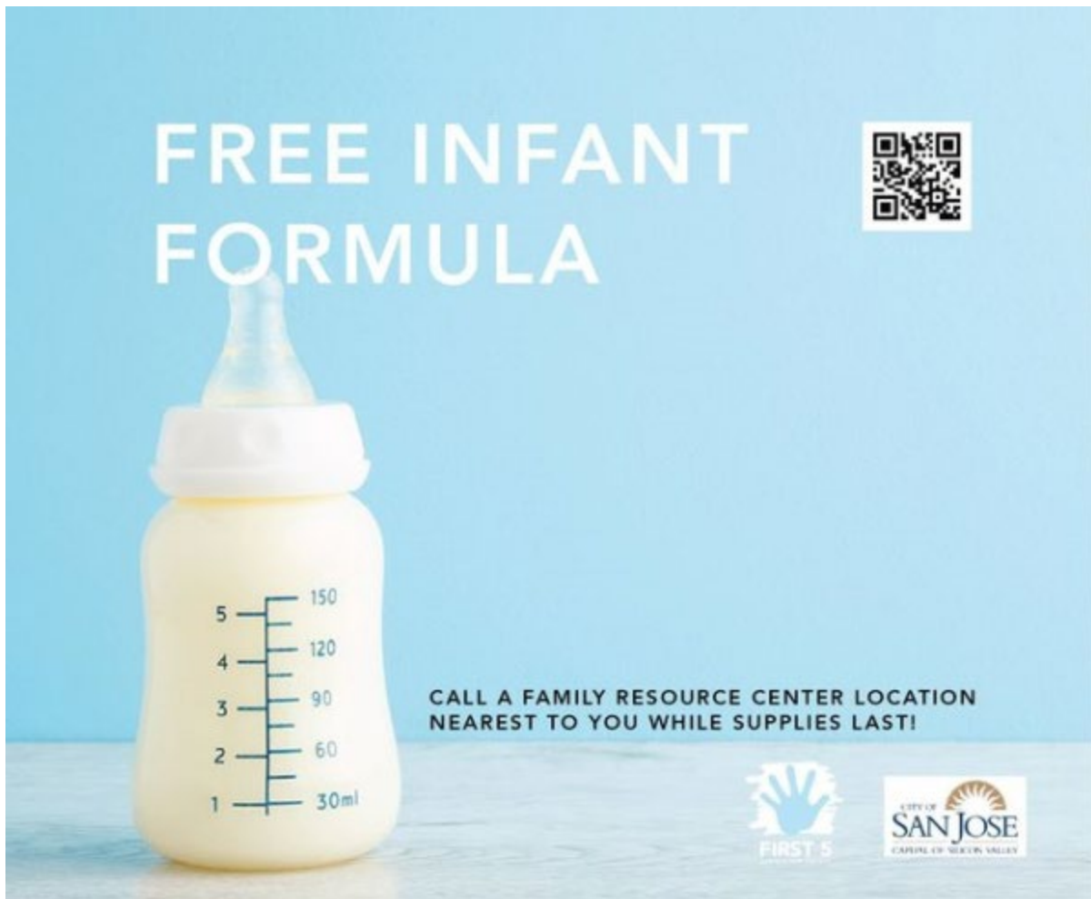
Free baby formula

Meals are available Monday-Friday from 12 – 1 p.m. while supplies last.