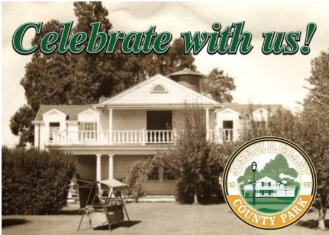
Grant House Reopening