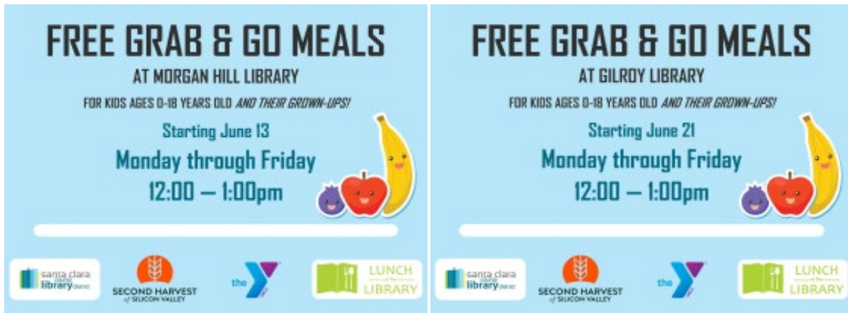
Free grab-and-go meals