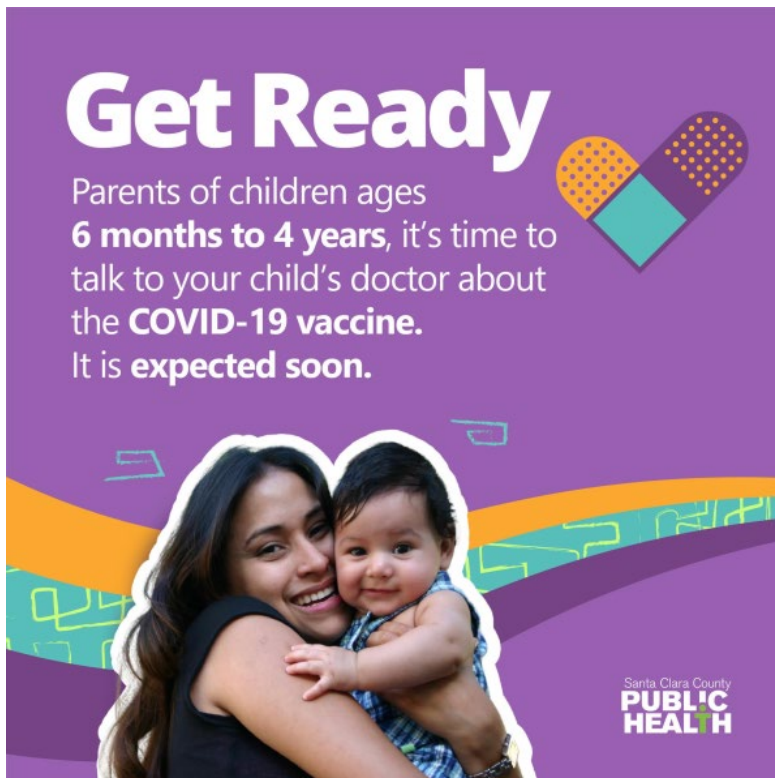
COVID vaccination for children 6 months to 4 years

Parents, we know you have been waiting a long time for this! Now is the time to contact your child's regular doctor to ask if they will be providing the vaccine once it is available. They can also check to see if your child is up to date on other vaccinations. If you don't have a regular doctor or insurance, call 1-866-967-4677 for assistance.