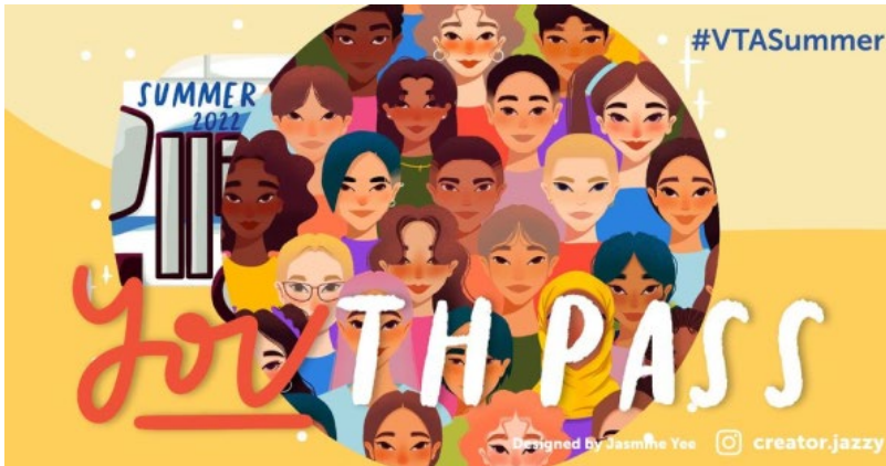
VTA Summer Youth Pass

VTA's Summer Youth Pass is the perfect way for young riders to get around Santa Clara County. Youth riders will receive unlimited rides on VTA buses and light rail trains from June through August for a highly discounted price of $70. A smooth ride isn't the only benefit to this pass, youth riders can expect to enjoy some cool summer perks and special offers from partners.