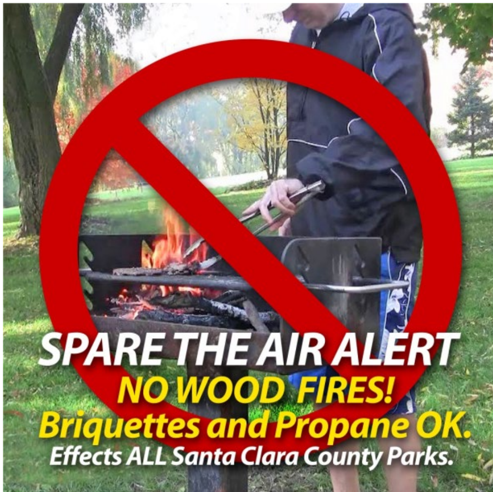
Spare the Air Alert