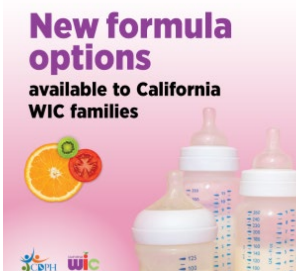
New formula options

Parents, we know you have been waiting a long time for this! Now is the time to contact your child's regular doctor to ask if they will be providing the vaccine once it is available. They can also check to see if your child is up to date on other vaccinations. If you don't have a regular doctor or insurance, call 1-866-967-4677 for assistance.