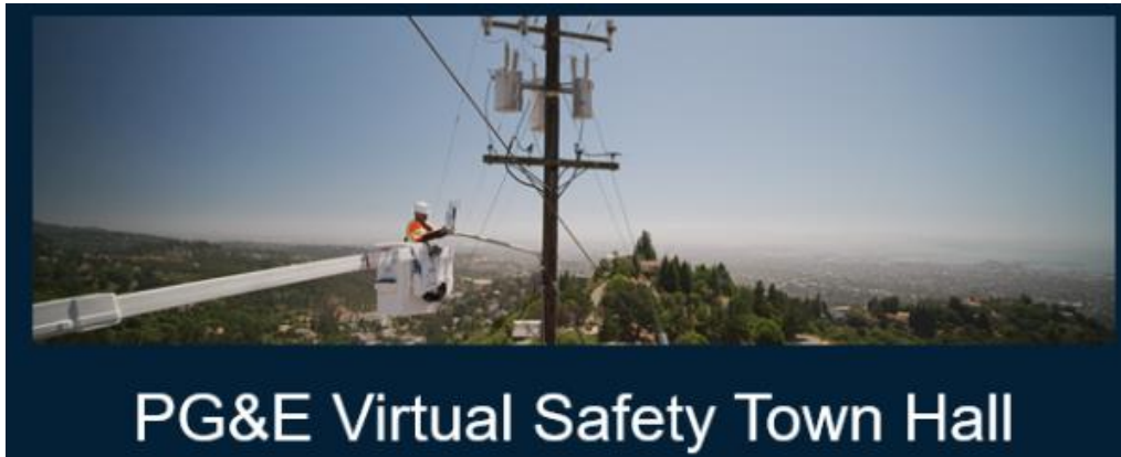
Virtual Town Hall

Santa Clara County residents are invited to join a virtual town hall for a discussion about PG&E's 2022 wildfire safety efforts. Participants will have the opportunity to ask questions and share feedback with the PG&E team, including regional leadership. To register, visit https://www.pge.com/en_US/safety/emergency-preparedness/natural-disaster/wildfires/community-wildfire-safety-open-house-meetings.page