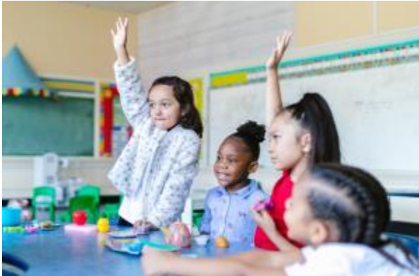
Summer Learning Program Support

You can register here: https://na.eventscloud.com/ereg/index.php?eventid=687935&