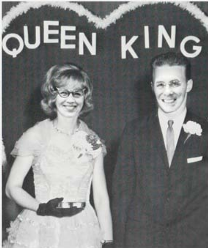
Super-duper cutest couple