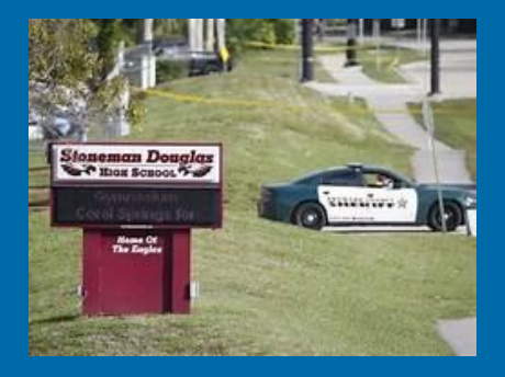
Stoneman Douglas H.S (Parkland, FL.) February 2018