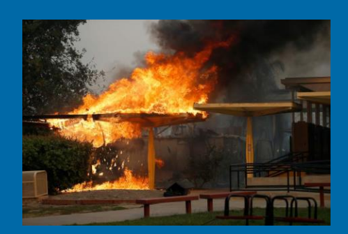
Tubbs Fire (Santa Rosa) October 2017