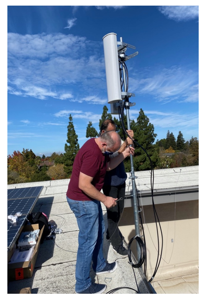
Figure 6: Campbell Union District Personnel Installing CBRS Antennas

CBRS involves an up-front investment that could be challenging to resource, but it will be more affordable in the long run than purchasing wireless broadband subscriptions from commercial carriers. The costs of replacing damaged user equipment are unknown at this time, but these would be little different than the costs of replacing damaged user equipment for commercial carrier use.