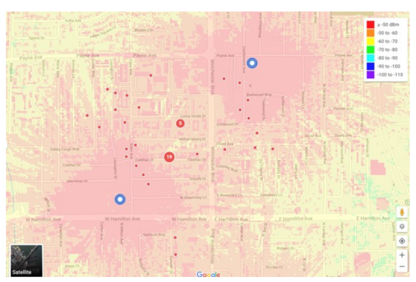
Figure 5: Coverage Estimation Modeling