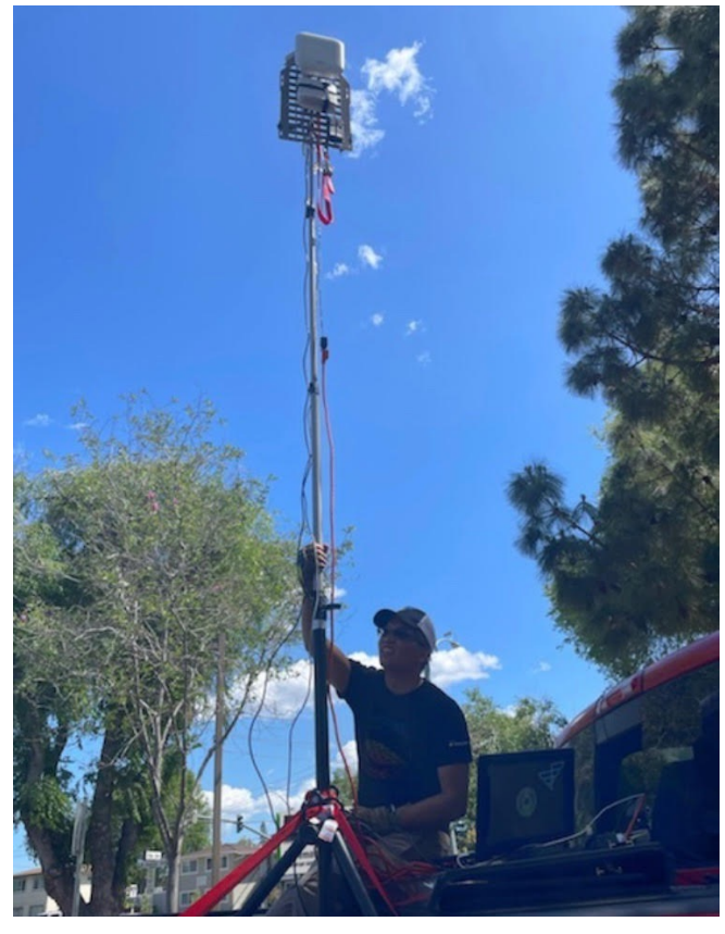
Figure 4: Improved Drive-Testing Rig

For Luther Burbank ES, we secured fixed-price contract with SBA Communications as the system integrator.