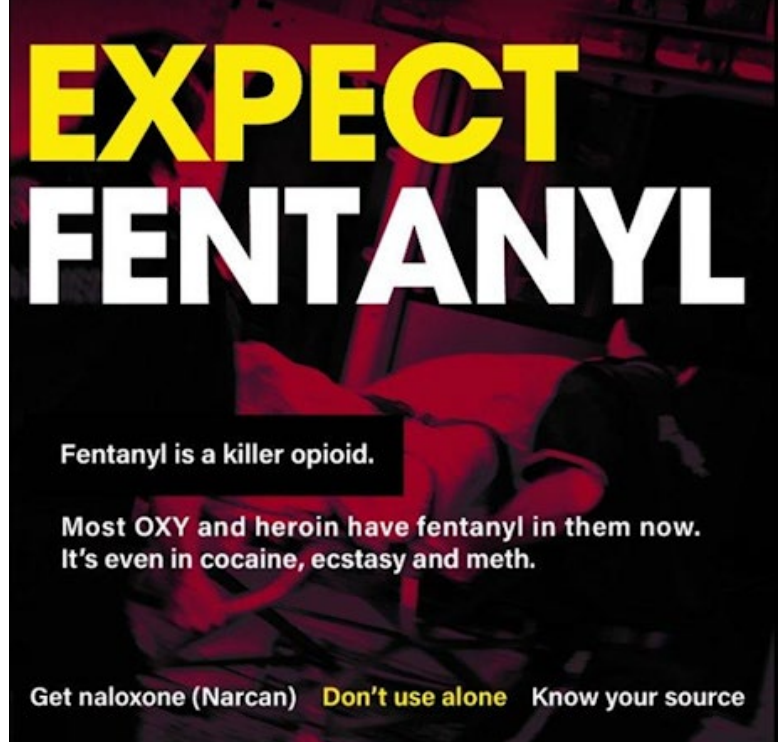
Expect Fentanyl Campaign • www.expectfentanyl.org