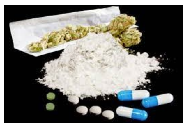
Fentanyl in Various Forms

In the past few years, fentanyl has been found in fake Oxycodone and Percocet pills as drug cartels sought to increase the potency of these illicit drugs. It is also found in marijuana and various capsule forms. However, brightly colored fentanyl, or rainbow fentanyl, has been recently identified as a new trend by the Drug Enforcement Agency (DEA). Rainbow fentanyl can take different forms, from brightly colored pills to gummy candy and colorful blocks. The California Department of Public Health has recently issued an alert regarding rainbow fentanyl as this new trend aims to attract young children.