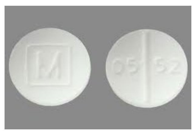
Illicit Oxycodone Pills laced with Fentanyl