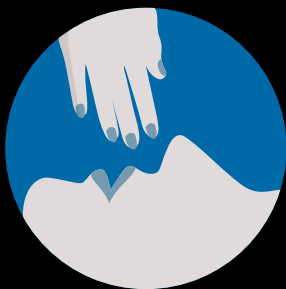
blue lips or nails