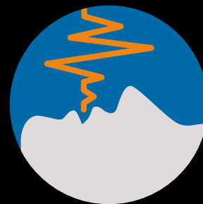
gurgling or snoring