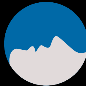
slow or not breathing