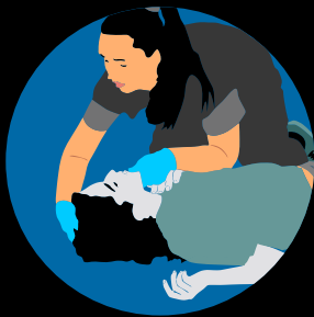
won't wake up

Look for these signs of an overdose early to save your friend's life.