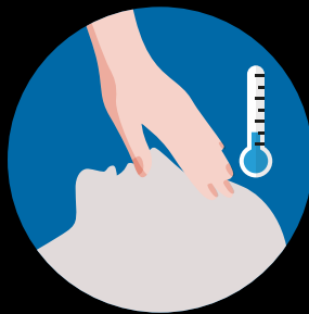
cold & clammy skin