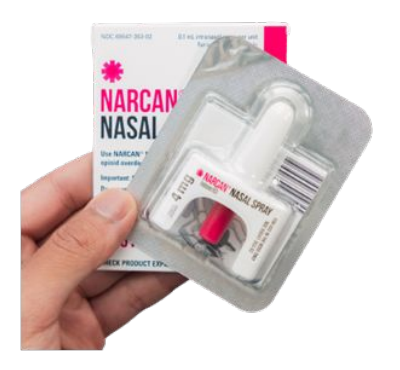
Narcan Naloxone Nasal Spray