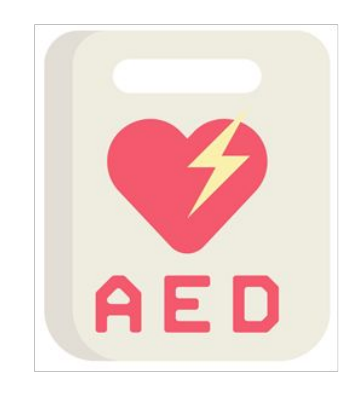
Automated External Defibrillator (AED)