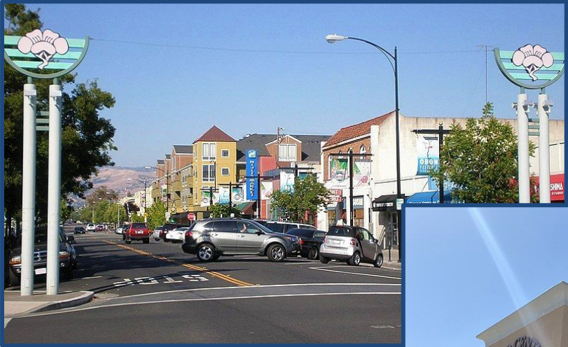
Japantown Pinoytown Heinlenville Chinatown