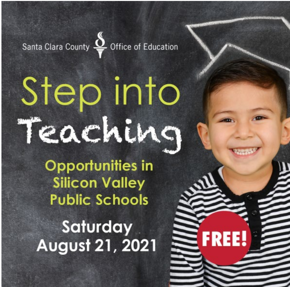
Step into Teaching

For more information, visit https://www.sccoe.org/jobfair .