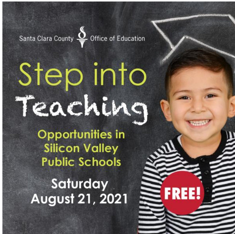
Step into Teaching

Join the SCCOE's Virtual Step into Teaching: Opportunities in Silicon Valley Public Schools Event to help learn and prepare for the joys of a teaching career.