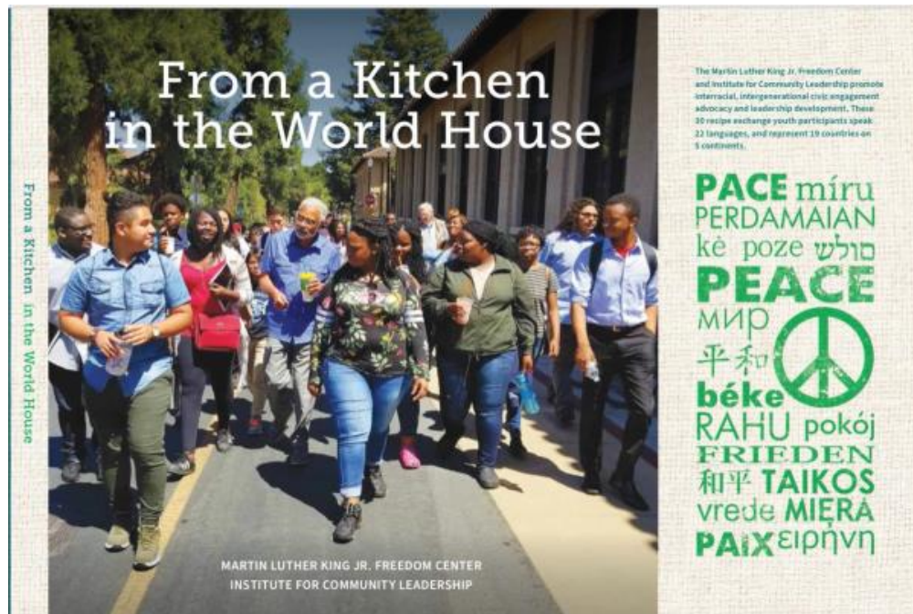
From A Kitchen In the World House

Stop by the Downtown San Jose Farmers Market this Friday, July 16th to meet with youth from the @mlkfreedomctr to talk about voter registration and learn about "From a Kitchen in the World House".