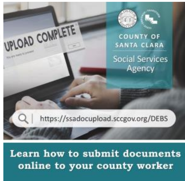
Social Services Video