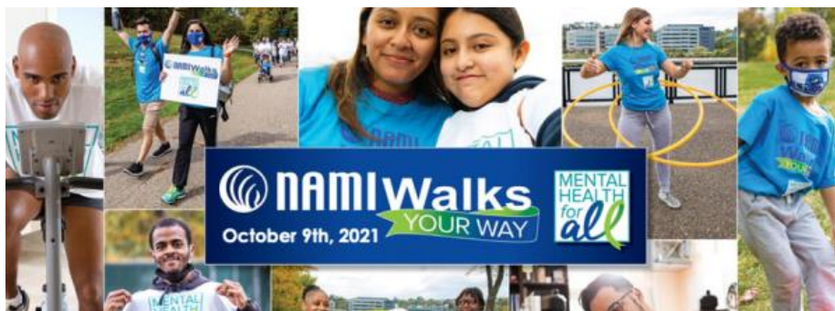
2021 NAMI Walks Your Way Silicon Valley

Wildfire season is here and Santa Clara County's free ReadySCC mobile app is a great tool to help you and your family create a wildfire action plan. Use the app to easily store emergency contacts, set an emergency meeting location, plan your go-bags, and much more. Learn more: http://sccgov.org/sites/oes/residents/Pages/ReadySCC.aspx