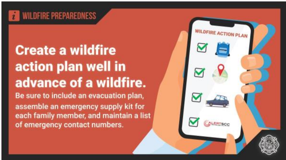
ReadySCC mobile app

https://www.youtube.com/watch?v=UG2sLCZ48dY