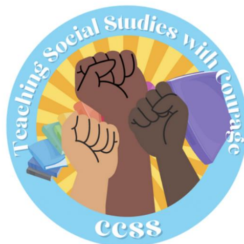
Call for workshop proposals

Registration is open! 8th Annual (Virtual) Inclusion Collaborative Conference October 20-21, 2021 To Register: https://2021icsc.eventbrite.com For more information: InclusionCollaborative.org