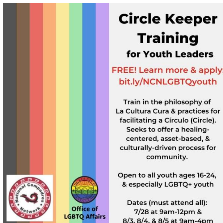
Circle Keeper Training for Youth Leaders