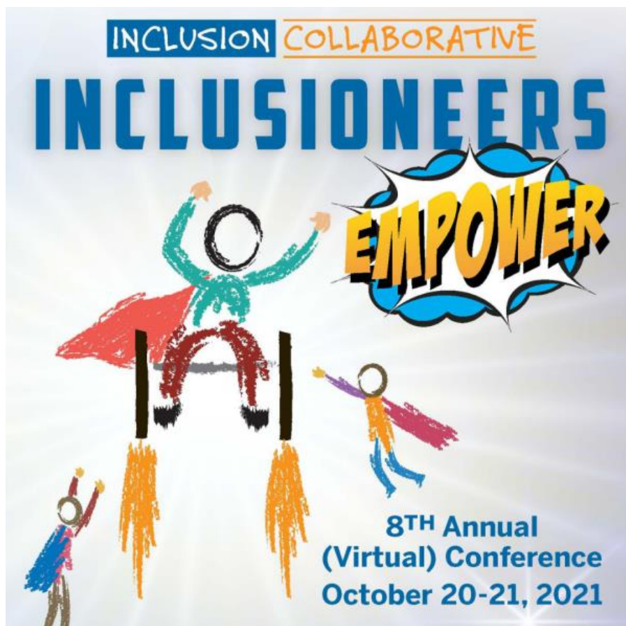
Inclusion Collaborative Conference

The Better Together newsletter shares what's happening this summer in Santa Clara's County Parks. https://conta.cc/3dAfNIM