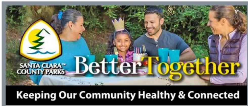
SCC Parks Newsletter

The Better Together newsletter shares what's happening this summer in Santa Clara's County Parks. https://conta.cc/3dAfNIM