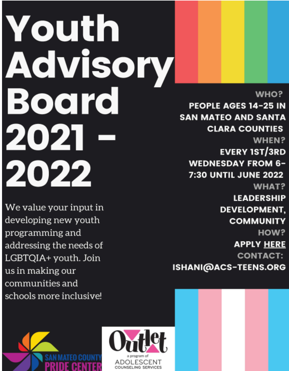
Youth Advisory Board

https://www.sccoe.org/trc/Pages/trc.aspx