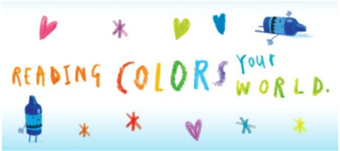
Summer Reading Program