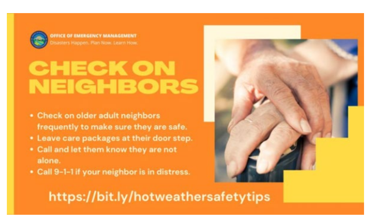
Check in on One Another

It's important to check in on our older adult neighbors by calling them and making sure they are drinking enough water and have access to air conditioning or a fan. If someone is unable to leave their home, you can deliver care packages for them! For cooling center locations and more information on preparing for extreme heat, visit <a href="https://bit.ly/hotweathersafetytips">https://bit.ly/hotweathersafetytips</a>.