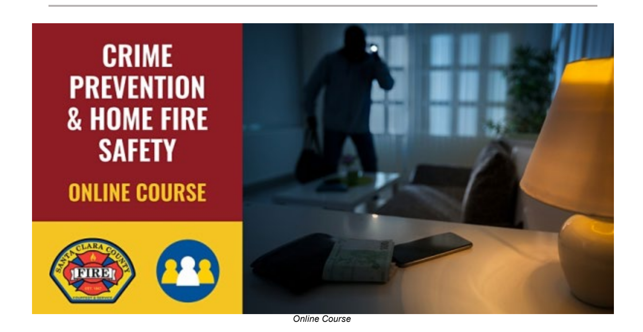
*Tuesday, June 29, 2021 10:00 - 11:30 a.m.

Santa Clara County Library District's (SCCLD) Summer Reading Program Reading Colors Your World encourages readers of all ages to expand their world through kindness, growth and community. Be creative, try new things, explore art, and find beauty in diversity. Join SCCLD for an exciting array of online programs for children, teens, and adults. Read a book and color your world this summer! All are invited to join June 1st through July 31st. It's free and fun for all ages! <a href="https://sccl.beanstack.org/reader365">https://sccl.beanstack.org/reader365</a>