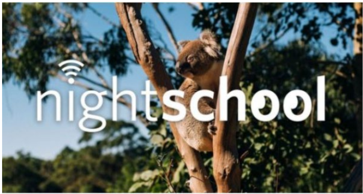
California Academy of Sciences

This week on California Academy of Sciences' NightSchool - the unique wildlife and ecosystems of Australia. Tune in for stories about platypuses, flying-foxes, koalas, and wombats, and how these populations are faring while facing climate change, wildfires, and urban development. Also: Find out how wombats produce cube-shaped poop. Streaming live on Facebook Thursday, June 17 at 7 p.m. PT.