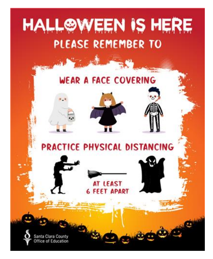
Click to download "Halloween Is Here"