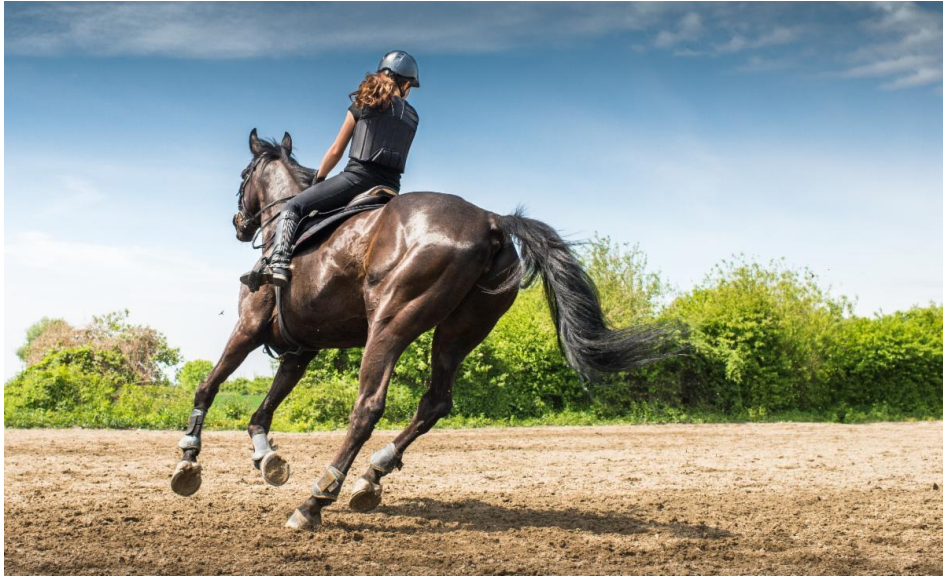
Woodside Area Equestrian Merit Scholarship

For the fifth year, The Mounted Patrol Foundation and the Woodside-area Horse Owner's Association (WHOA!), two equine-focused charitable organizations, have joined together to offer an annual $10,000 "Woodside Area Equestrian Merit Scholarship". This scholarship is granted to a high school senior demonstrating involvement in, and future dedication to, equine-related activities. Community involvement and academic achievement will be considered with a strong emphasis on financial need.