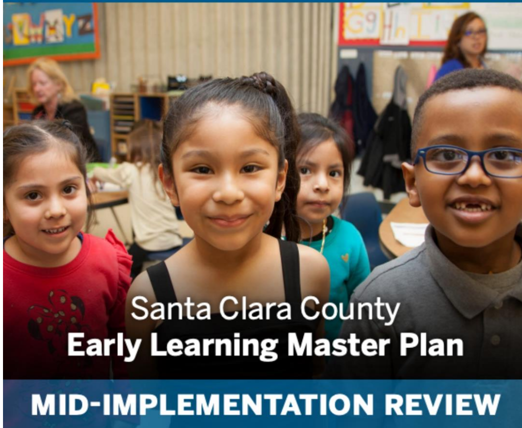
Santa Clara County Early Learning Master Plan

Santa Clara County's Early Learning Master Plan serves as a north star for providing access to high-quality early care and education to our county's youngest learners and their families.