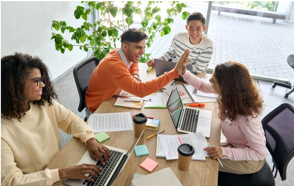
Equitable Grading Community of Practice

To view them, visit: https://sccoe.to/GrantOpportunitiesforEducators