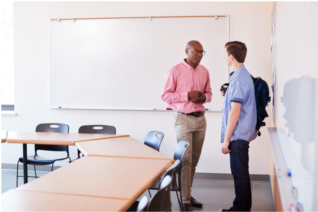
Kognito Mental Health and Wellbeing Trainings

In partnership with Santa Clara County Behavioral Health, the SCCOE has free trainings available for both educators and students around mental health. This training is virtual and asynchronous. The deadline to complete this training is June 30.