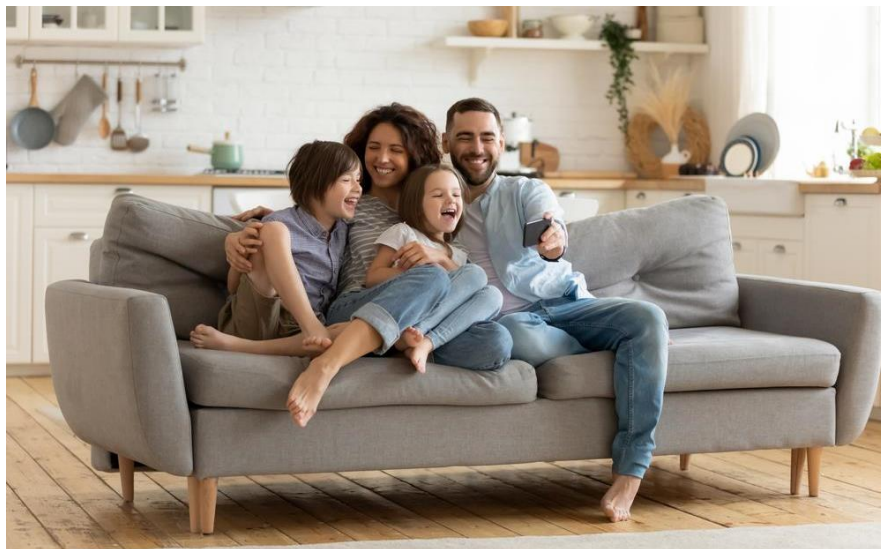
Santa Clara County Early Learning Webinar

Learn more: https://whoa94062.org/merit-scholarship-2024-application/