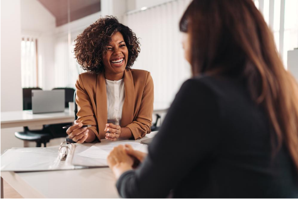
Community Behavioral Health Internship

San Jose City College and the Behavioral Health Contractors' Association of Santa Clara County are partnering to bring people 18 and older an eight-week entry-level paid internship. The goal of the internship is to provide community members with professional development skills in the behavioral health field.