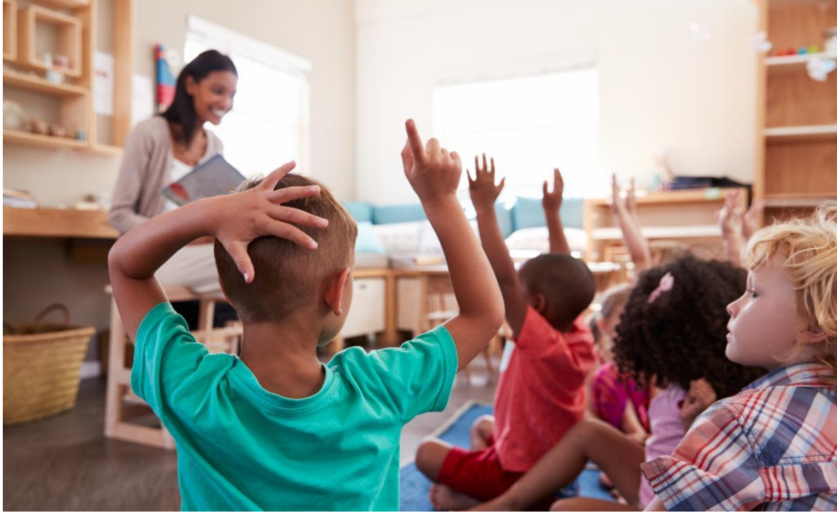
Classified School Employee Teacher Credential Grant Program

Interested in becoming a credentialed teacher? If you hold an Associates in Arts (AA) degree or 48 college credits and you want to become a classroom teacher, join our Classified School Employee Teacher Credential Grant Program. You can receive an annual $4,000 stipend towards your tuition for completing a bachelor's degree and teaching credential!