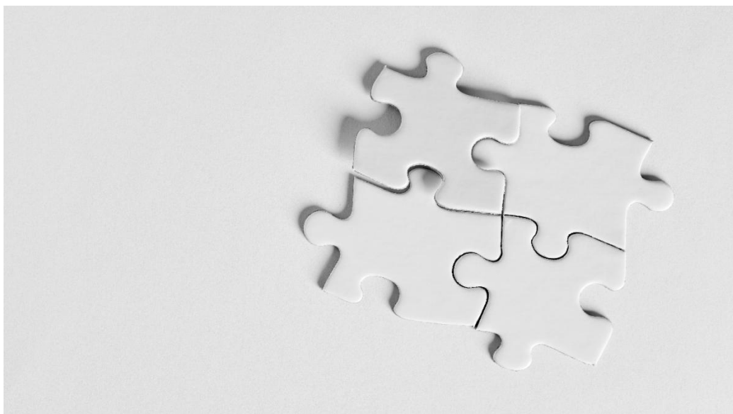
Community Schools Leading and Learning

In partnership with Inflexion, the Santa Clara County Office of Education is hosting a workshop series aimed at empowering staff involved in community schools transformations.