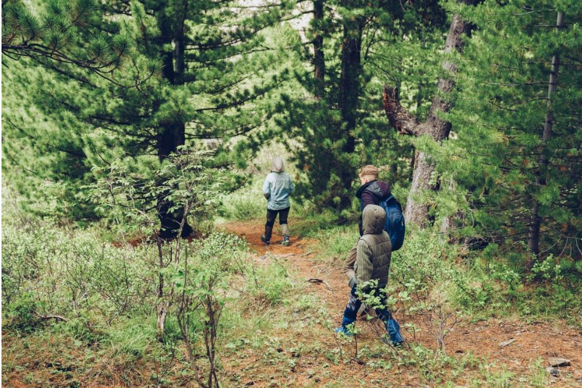
California State Parks Adventure Pass

This school year's fourth graders can sign up for the FREE California State Parks Adventure Pass! The Adventure Pass is good for free day-use entrance to 19 select California State Parks for 4th graders and their families. This pass is valid until August 31, 2024.