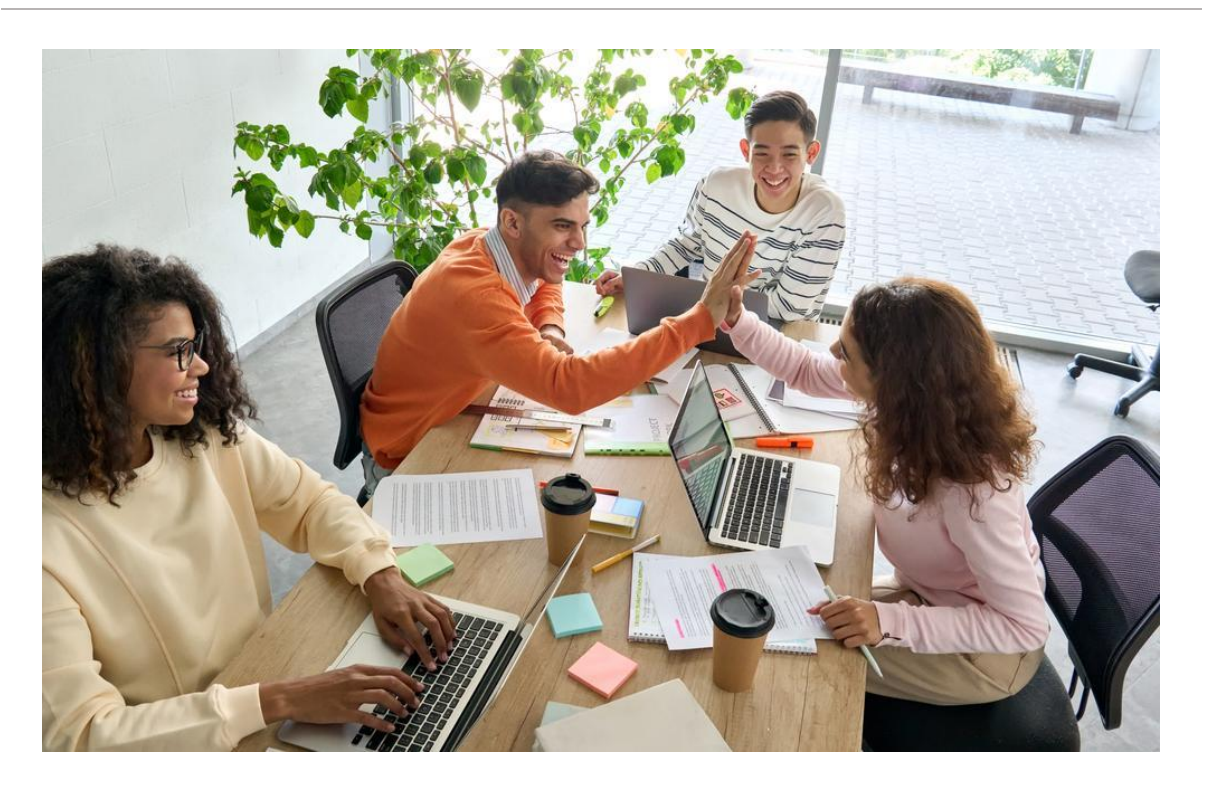
Equitable Grading Community of Practice

*There is a cost associated with this event.