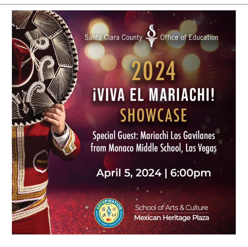
¡Viva el mariachi! Showcase

The SCCOE is sponsoring the second annual showcase of youth mariachi and folklórico groups. The event will take place at the Mexican Heritage Plaza on April 4, at 6:00 PM. To register, visit: <u>https://sccoe.to/mariachishowcase</u>