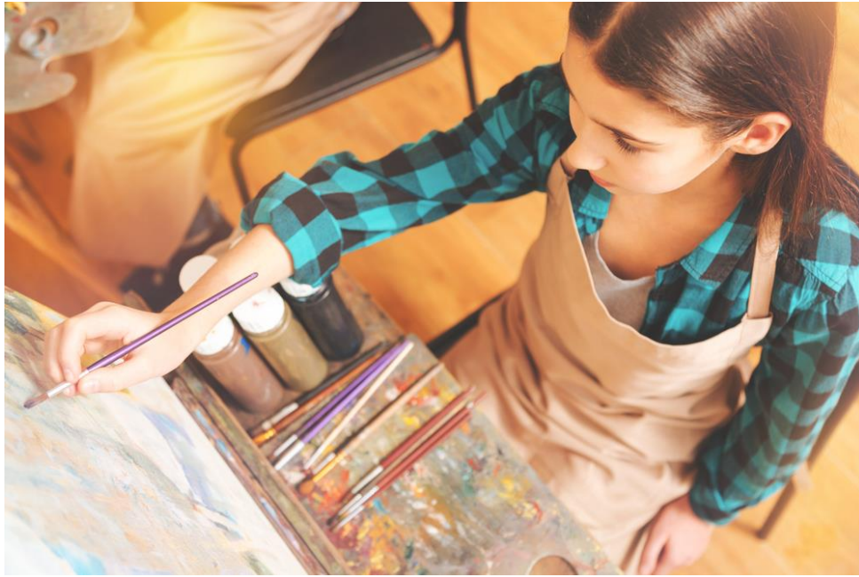
211 Art Contest

United Way Bay Area is hosting a 211 Art Contest. High school students and adults are encouraged to submit art that portrays the impact and significance of 211 services in your community.