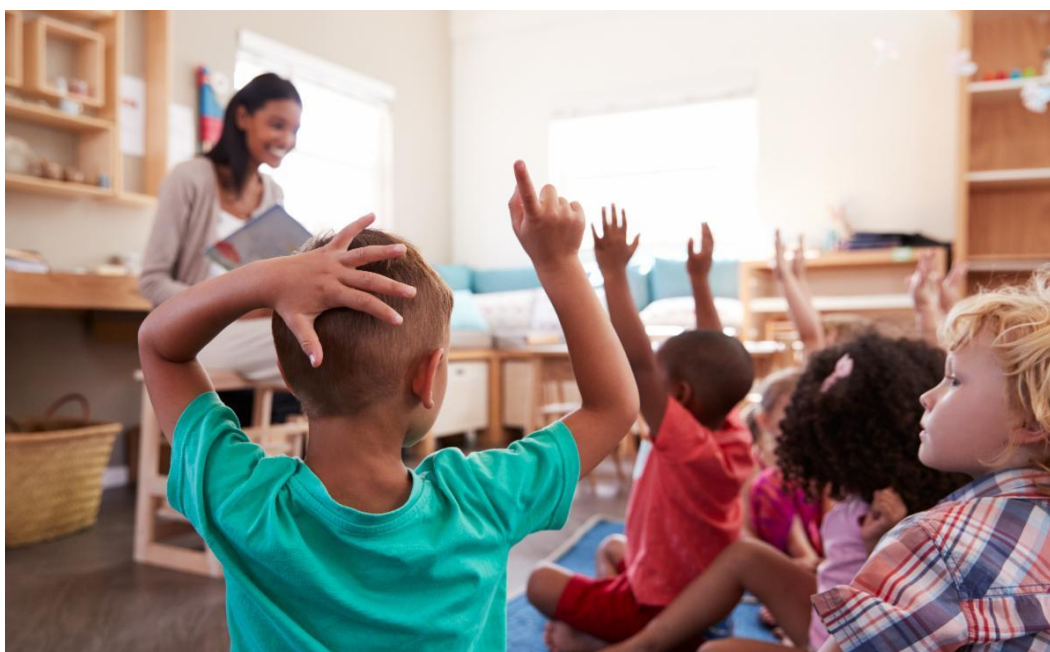
Office of the California Surgeon General has a Safe Spaces Training

visit: https://www.linkedin.com/events/studentmeetandgreet7155260513873010688/