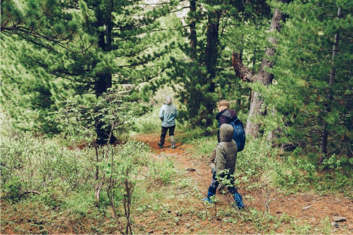
Coyote Creek Watershed Field Trip

Santa Clara County Parks has a free school field trip program designed for first and second-grade classes. This program allows students to explore the ways animals have adapted to the Coyote Creek Watershed in Morgan Hill.