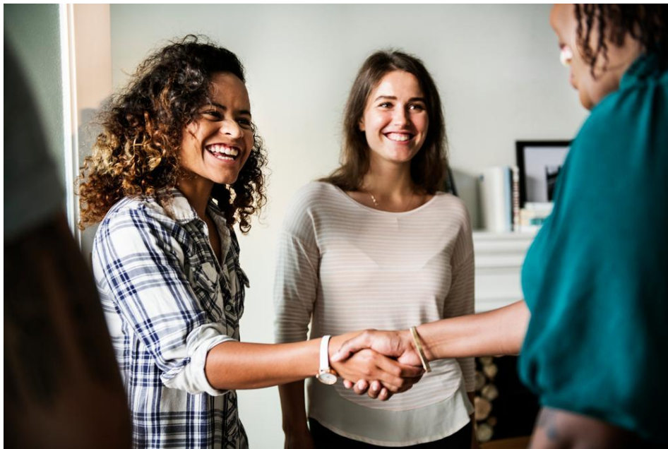
Student Meet and Greet

The Santa Clara County Public Health Department will host a Student Meet and Greet on March 1 from 2:30 p.m. to 4:30 p.m. at 150 W. Tasman Dr. San Jose. This event is an opportunity for college students or recent graduates to learn more about Public Health Operations, internships, volunteer opportunities, and networking opportunities.