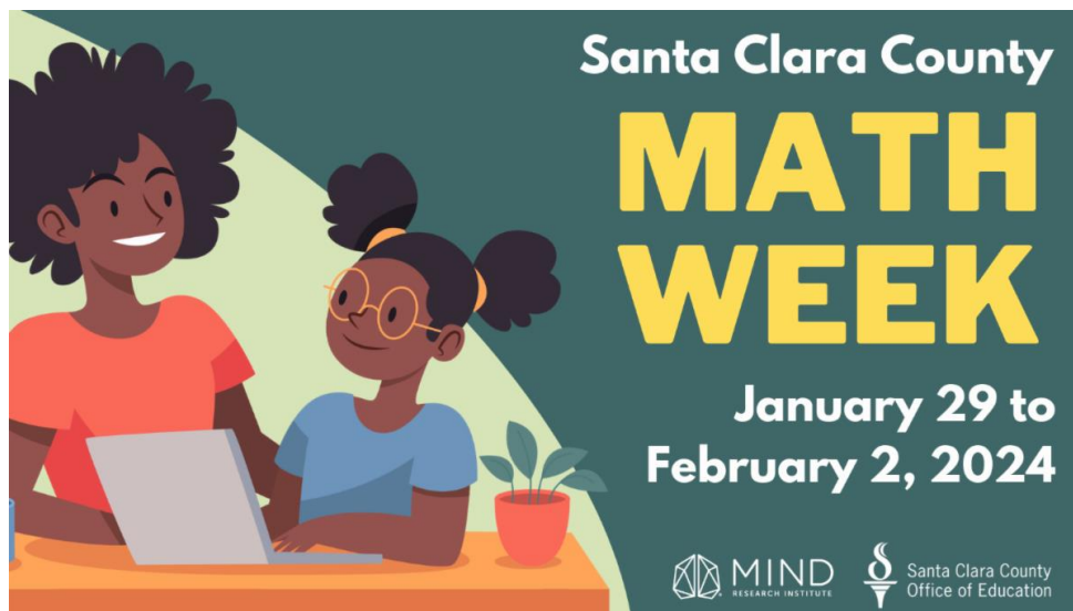
Santa Clara County Math Week

To learn more, visit: https://uwba.org/211artcontest/