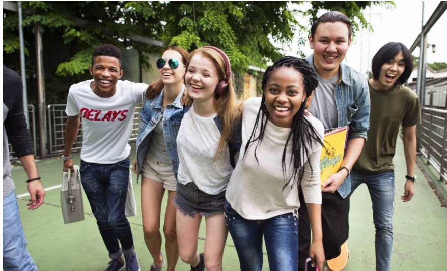
PAAC Youth Resource Fair

High school students in Santa Clara County are encouraged to attend the TUPE Peer Advocate Advisory Council (PAAC) Youth Resource Fair to learn more about important efforts within the county, connect with like-minded individuals, discover opportunities to help you grow your skill set, and get prepared for college.