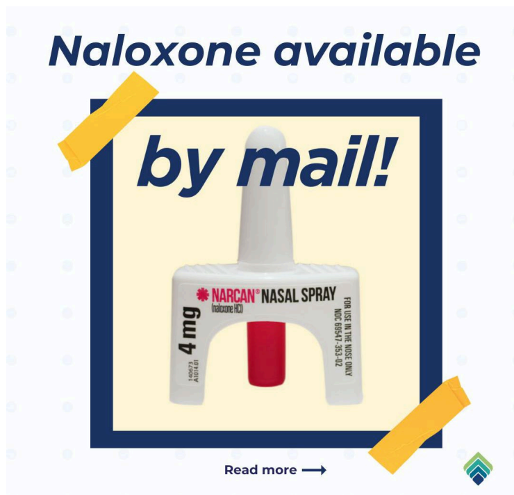
Naloxone Available by Mail

The Santa Clara Public Health Department will host a free resource fair for the community. Resources provided include vaccines, dental screenings, food box distribution and more. This event will be on January 19 from 2 p.m. to 5 p.m. at the Healthy Communities Branch Story Road Hub, 1775 Story Road #120 San Jose, CA 95122.