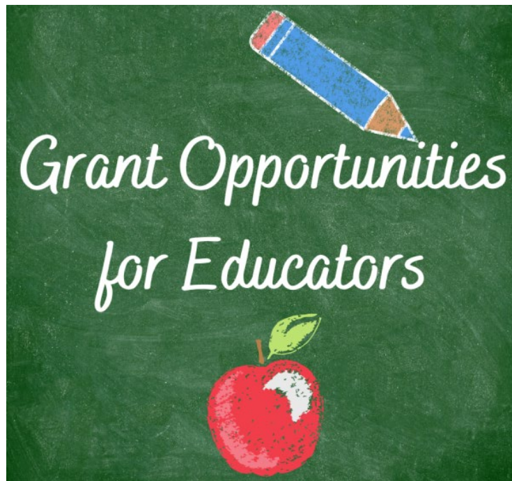
Grant Opportunities for Educators

To register, visit: https://sccoe.to/TeachersShowcaseRSVP