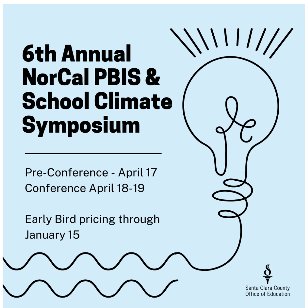
6th Annual NorCal PBIS and School Climate Symposium

The SCCOE will host the 6th Annual NorCal PBIS and School Climate Symposium on April 18 and 19 from 9 a.m. to 3 p.m. This conference will focus on multi-tiered systems of support, culturally sustaining practices, interconnected systems framework, mental health, and more. Early bird pricing is available through January 15.