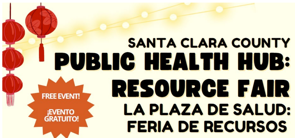
Public Health Hub: Resource Fair

The Santa Clara Public Health Department will host a free resource fair for the community. Resources provided include vaccines, dental screenings, food box distribution and more. This event will be on January 19 from 2 p.m. to 5 p.m. at the Healthy Communities Branch Story Road Hub, 1775 Story Road #120 San Jose, CA 95122.