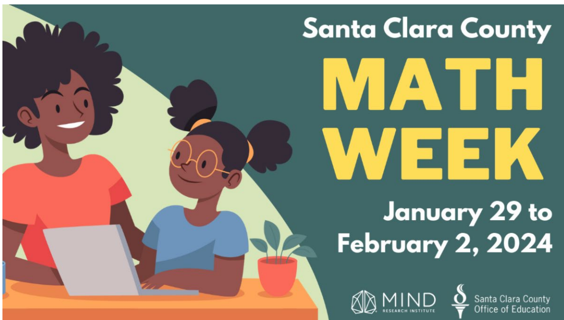
Santa Clara County Math Week

To learn more or register, visit: www.sccoe.org/stepintoteaching