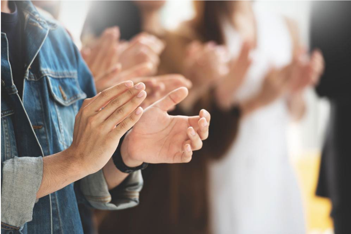
SVYCA's 2024 Green New Year Celebration

To play online with us please visit: https://sccoe.to/mathweek