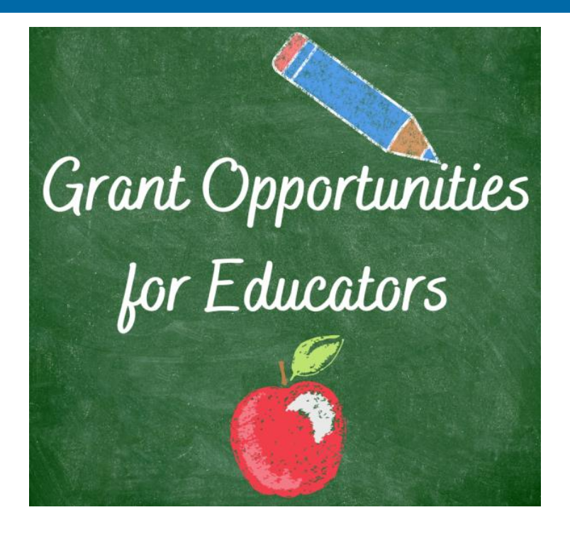
Grant Opportunities for Educators

Educators are encouraged to view the grant opportunities available to them.