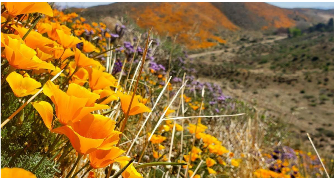
California Indian Education Task Force (CIETF)