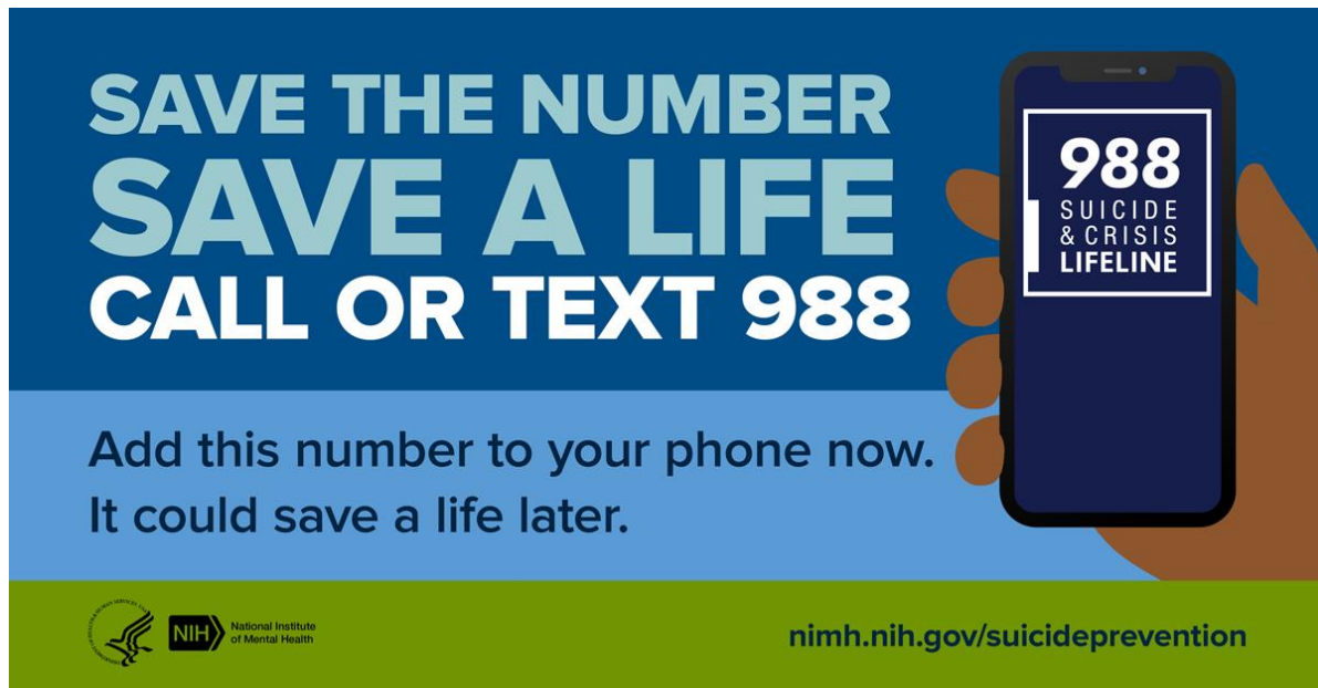
988 Suicide & Crisis Lifeline

To learn more or complete the training, visit: https://osq.ca.gov/safespaces/