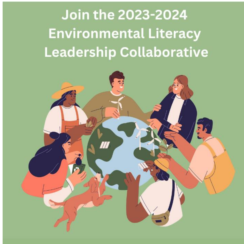
Environmental Literacy Leadership Collaborative

To learn more or apply, visit: https://sccoe.to/AB1703EdApp