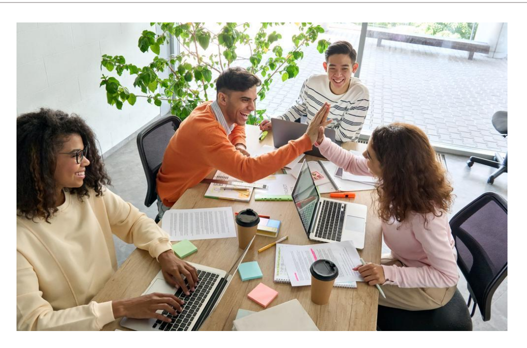
Equitable Grading Community of Practice

To learn more or apply, visit: https://sccoe.to/AB1703EdApp