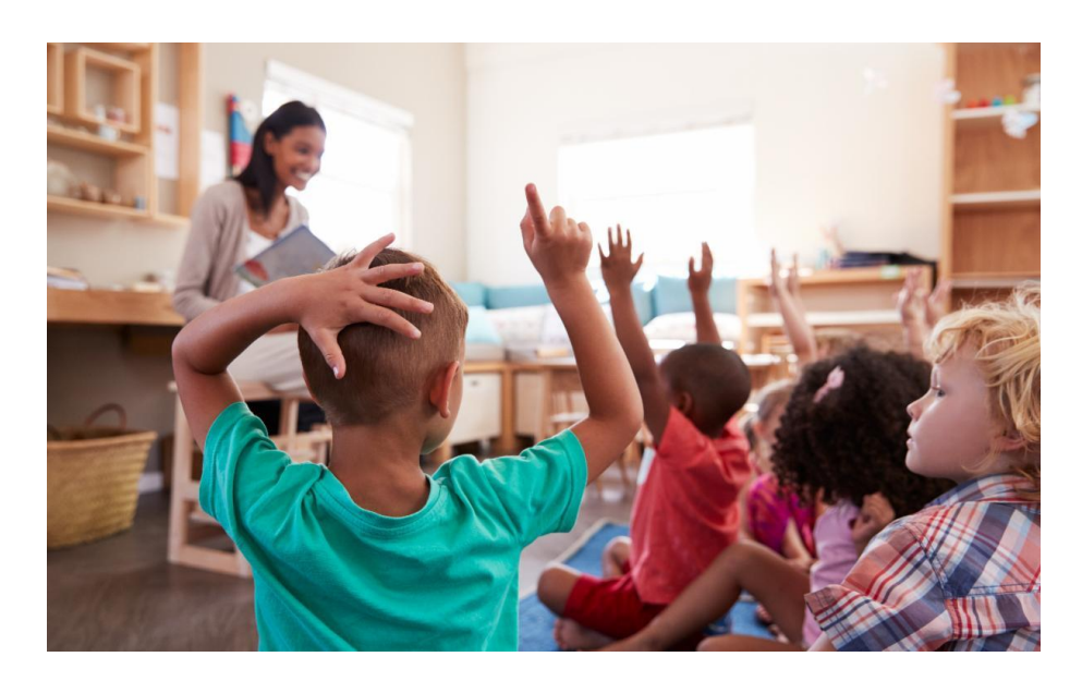
Office of the California Surgeon General Safe Spaces Training

To view this resource, visit: https://news.caloes.ca.gov/what-to-do-after-a-severe-storm/