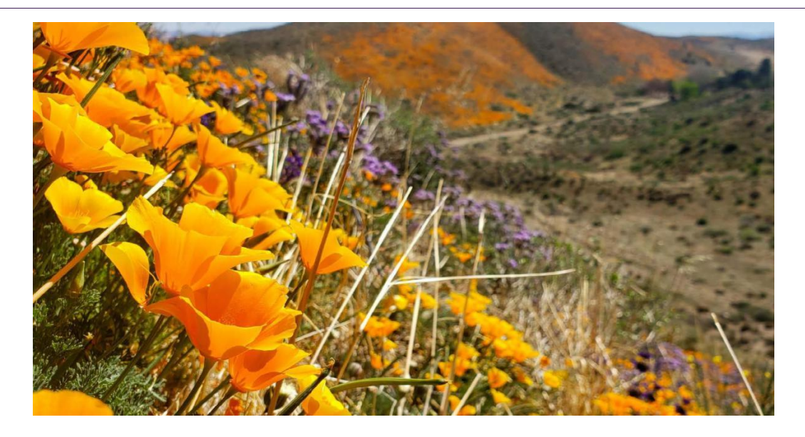
California Indian Education Task Force (CIETF)

The Santa Clara County Office of Education is welcoming 2 Santa Clara County educators to its California Indian Education Task Force (CIETF) to inform creating, curating and/or recommending high quality curriculum related to the diversity of local tribes, tribal experiences and perspectives, history, culture, and government. These recommendations will be shared with school districts in our county.