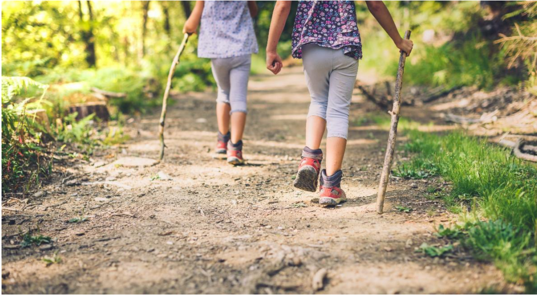
California State Park Adventure Pass

Fourth graders are able to visit 19 state parks for free with the California State Park Adventure Pass. Parents of fourth grade students can sign up for the pass on behalf of their student.