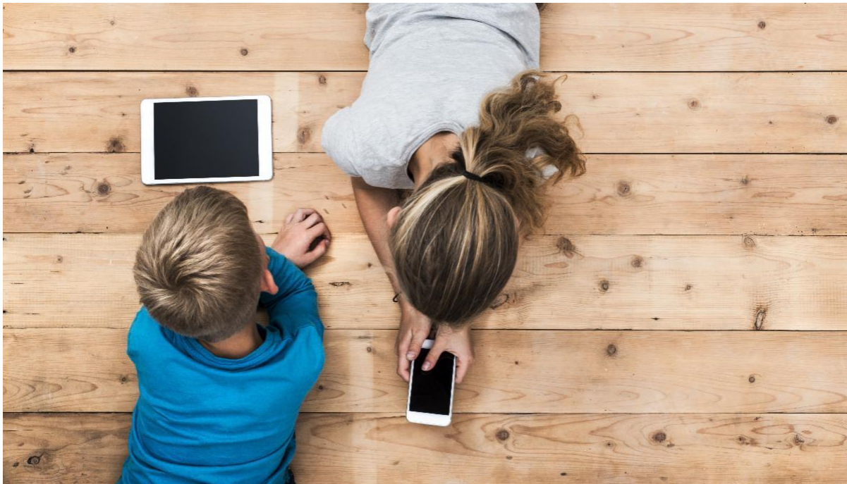
Social Media and Youth Mental Health Q&A Portal

The American Academy of Pediatrics is hosting an online Q&A regarding social media and youth mental health. This portal contains questions submitted by others for all age groups and it contains an opportunity for individuals to submit their own questions.