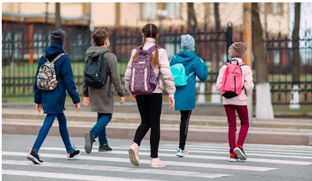
School Safety Plan Webinar

To view them, visit: https://sccoe.to/GrantOpportunitiesforEducators