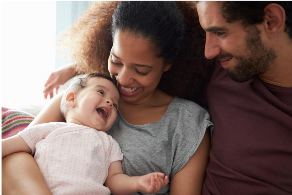
California Kit for New Parents

To learn more, visit: https://sccl.bibliocommons.com/events/651f016d2d0219cf8b5f58f0