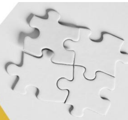
Transformational Learning Communities

(Alameda, Contra Costa, Marin, Napa, San Francisco, San Mateo, Santa Clara, and Sonoma counties)