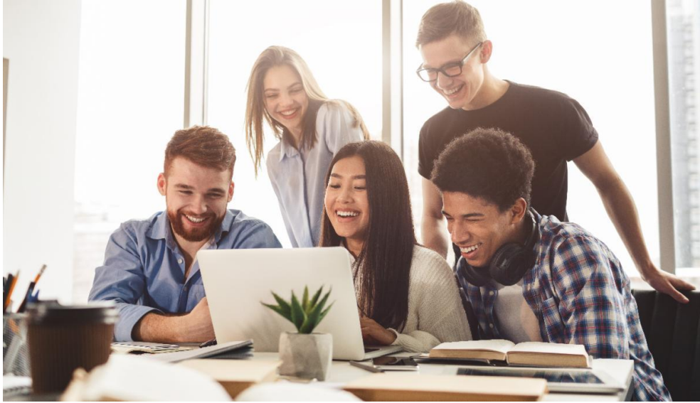
College Day: How to Find a College That Fits

The Santa Clara County Library District will host an online event titled College Day: How to Find a College That Fits. In this event, attendees will learn more about how to find a college that fits their needs. This event is on November 7 from 6 p.m. to 7:30 p.m.