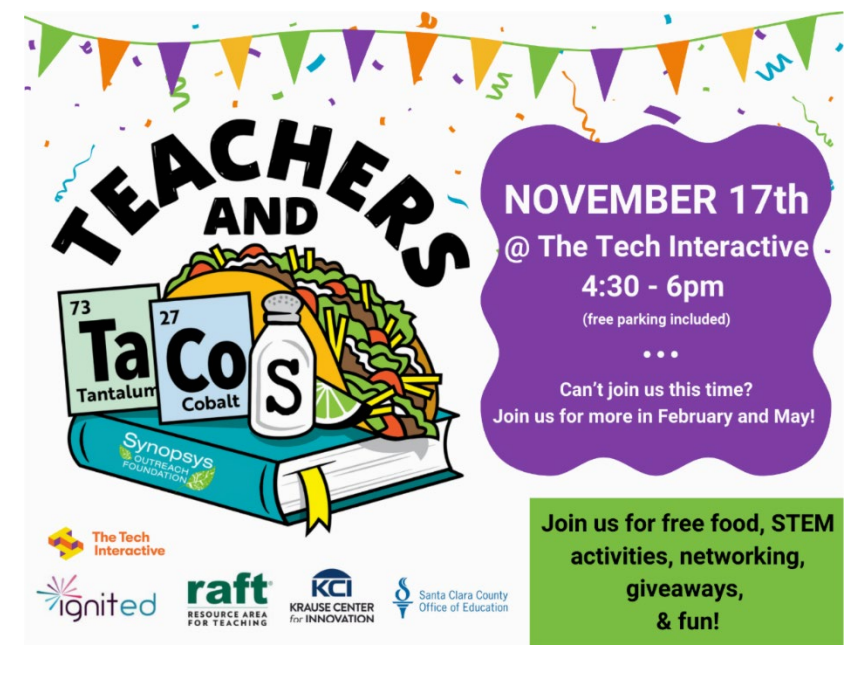
Teachers and Tacos

To learn more, visit: https://sccoe.to/ewpadvising