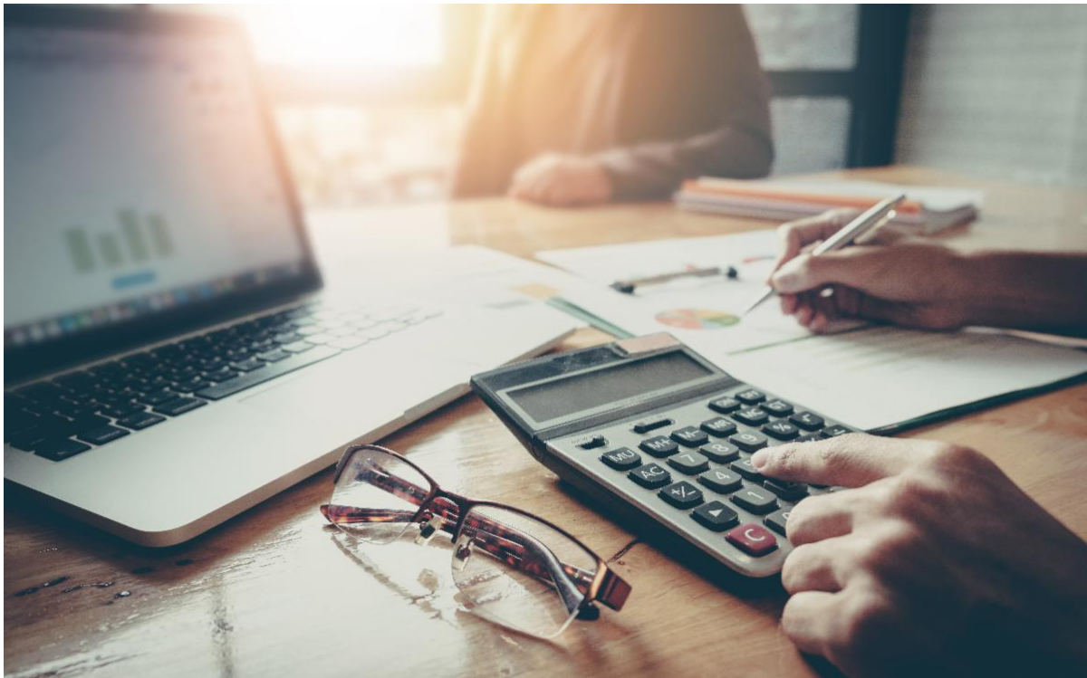
School-Based Billing Professional Learning Network

*There is a cost associated with this training.