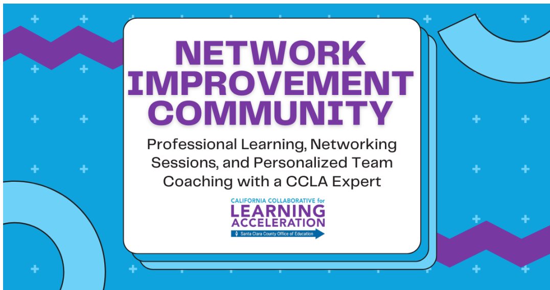
Network Improvement Community

The California Collaborative for Learning (CCLA) will host a free in-person network improvement community series for Santa Clara County educators on November 2. This is an opportunity for 3rd through fifth grade teams to participate in professional learnings, networking sessions, and personalized coaching from a CCLA math or literacy expert.