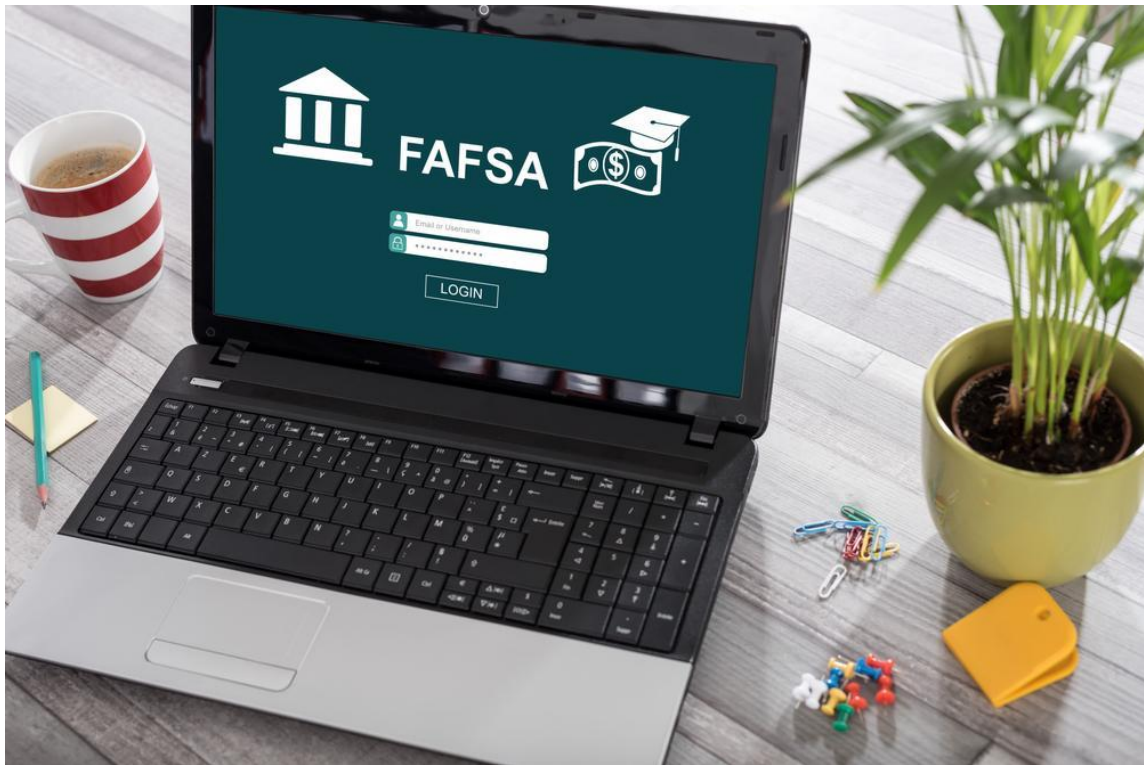
5th Annual Federal Financial Aid Virtual Bootcamp

The United States Department of Education will host a virtual series of workshops to provide families with information about how to prepare and apply for Free Application for Federal Student Aid (FAFSA). Attendees will also learn about repayment options, tools to prevent federal student loan default, and tools to compare universities.