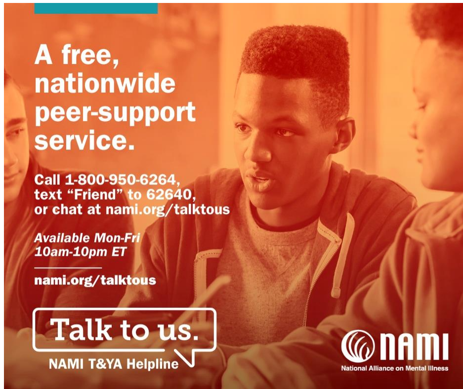
NAMI Teens and Young Adults Helpline

The National Alliance on Mental Illness (NAMI) has mental health resources for teens and young adults. For teens or young adults who would like to access this resource text "Friend" to 62640, chat at nami.org/talktous , call 1-800-950-6264