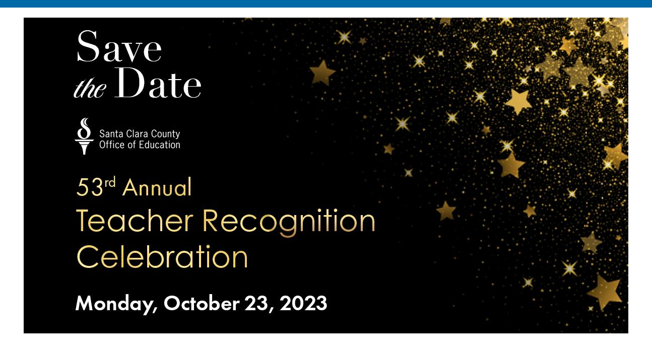
Teacher Recognition Celebration

Districts within Santa Clara County are encouraged to attend the 53rd Annual Teacher Recognition Celebration on October 23 at the Campbell Heritage Theater. This event honors and celebrates teachers within our county.