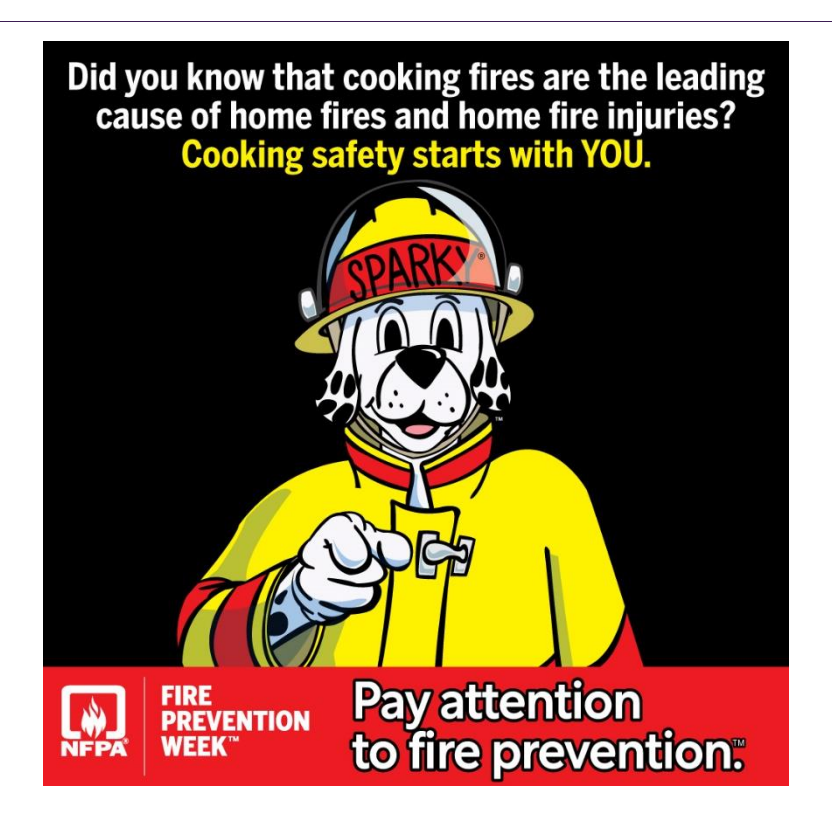
Fire Prevention Week

This week is Fire Prevention Week. The National Fire Prevention Association (NFPA) and Sparky the Dog remind families that we all must be safe while cooking. Did you know that cooking fires are the leading cause of home fires and home fire injuries?