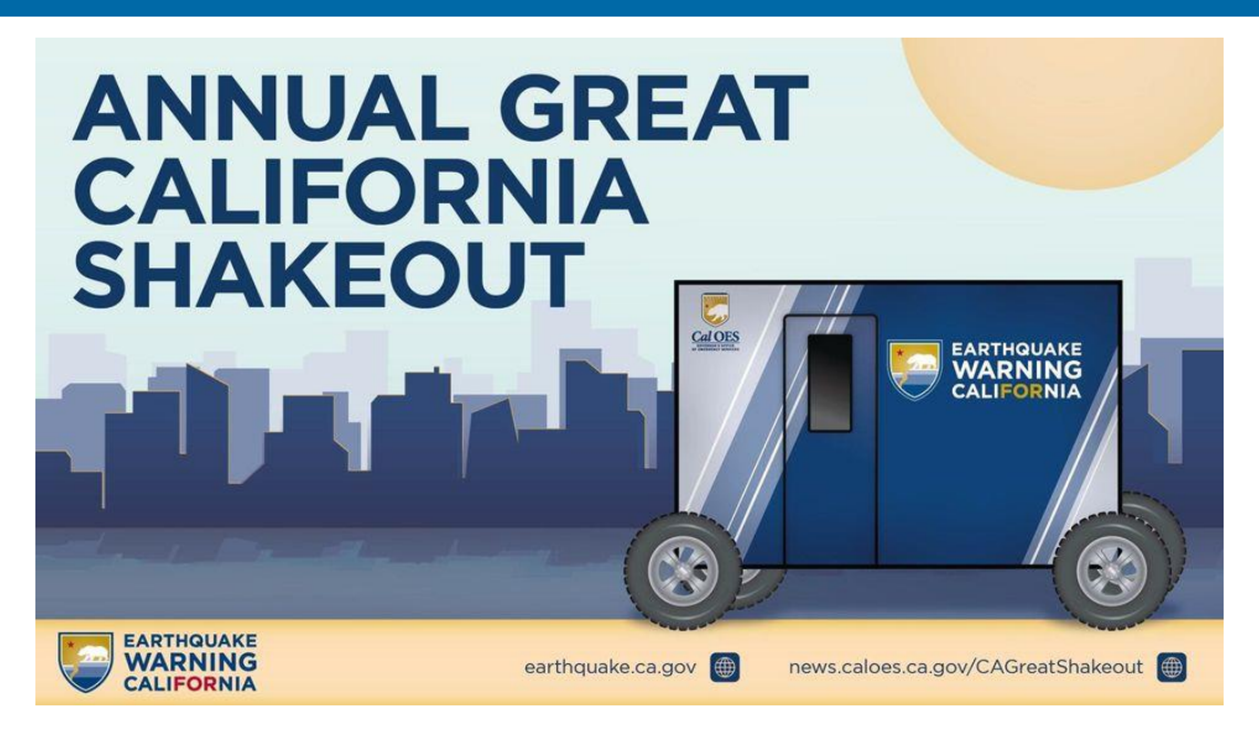
Annual Great California Shakeout

Each year the California Governor's Office of Emergency Services hosts the Great California Shakeout. On October 19, it is encouraged that Californians practice how to stay safe during an earthquake.