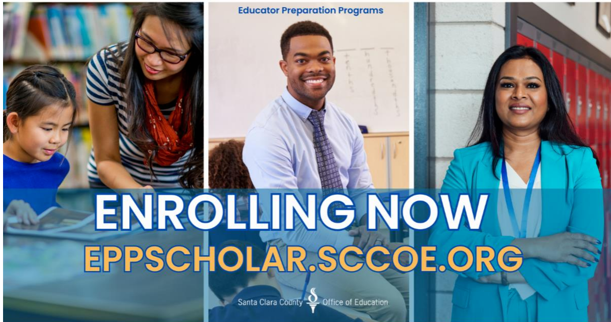
Educator Preparation Programs

The SCCOE's Educator Preparation Program (EPP) is seeking applications for programs listed below: