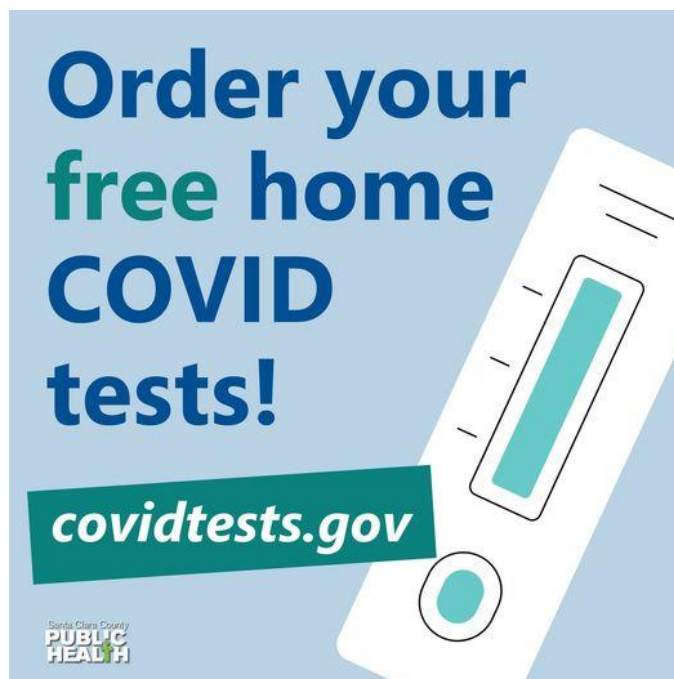
Order Free COVID-19 At-Home Tests