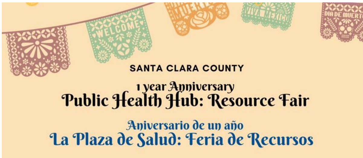
Public Health Hub: Resource Fair

To learn more, visit: https://a23.asmdc.org/event/20230930-family-health-and-wellness-fair