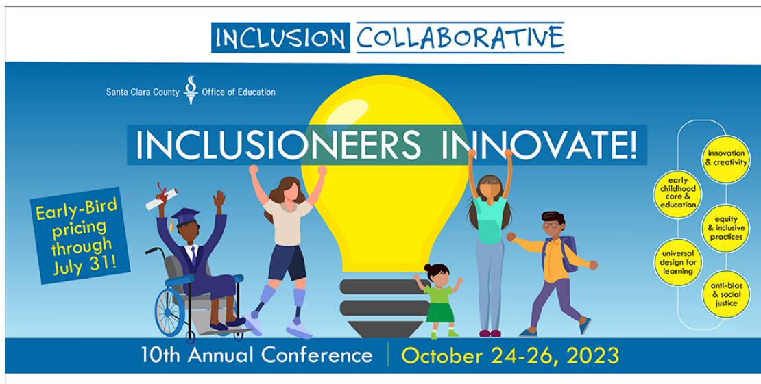
Inclusion Collaborative Annual Conference

The Inclusion Collaborative State Conference is a hybrid, 3-day professional development opportunity focused on creating or enhancing equity, diversity, and inclusive practices. It is