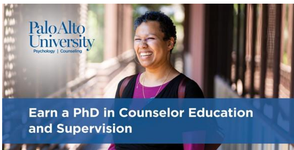
Palo Alto University PhD in Counselor Education and Supervision

To learn more, visit: https://www.sccoe.org/educator-preparation-programs/Pages/ewp.aspx