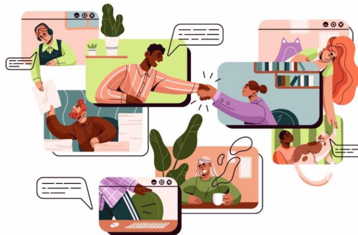
2023-2024 TOSA & Instructional Coaches Network Meeting

To learn more or register, visit: https://na.eventscloud.com/ereg/index.php?eventid=754620&