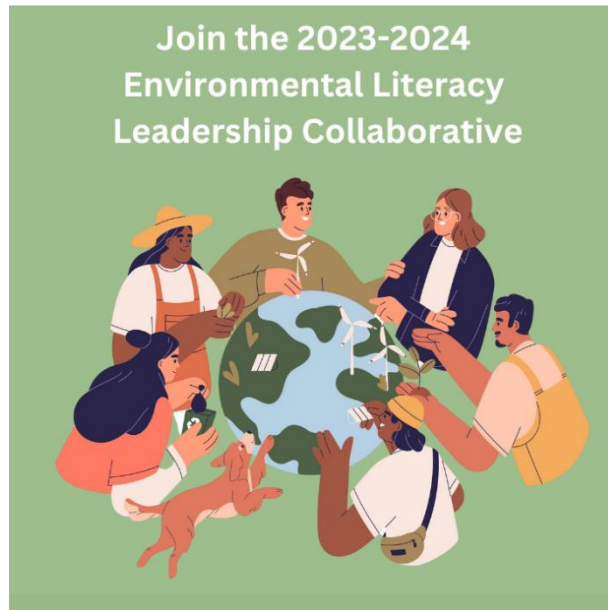
Environmental Literacy Leadership Collaborative

Join the Environmental Literacy Leadership Collaborative, a network of Community Based Partner organizations and Educators that will continue to explore ways to infuse environmental literacy into classrooms, schools, and districts.