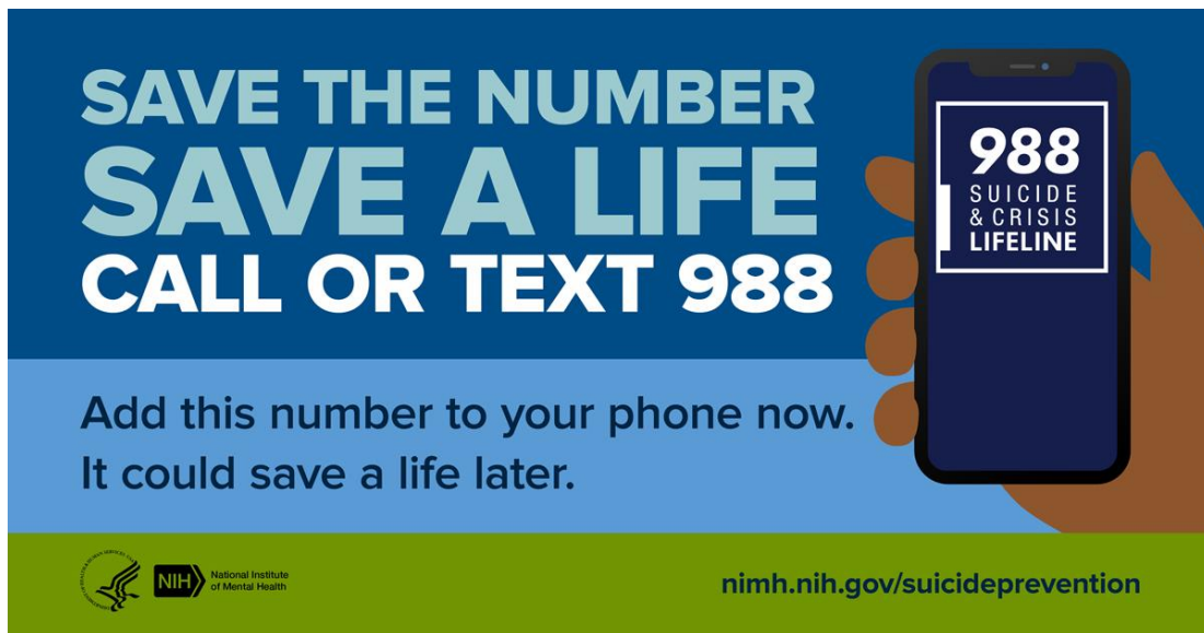
988 Suicide and Crisis Lifeline

To learn more about this event, visit: www.preparescc.org/fair