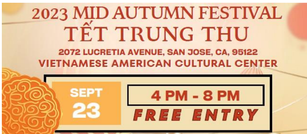
2023 Mid Autumn Festival

To learn more, visit: https://www.sanjoseca.gov/your-government/departments-offices/parks-recreation-neighborhood-services/youth-intervention-services/safe-communities-summit