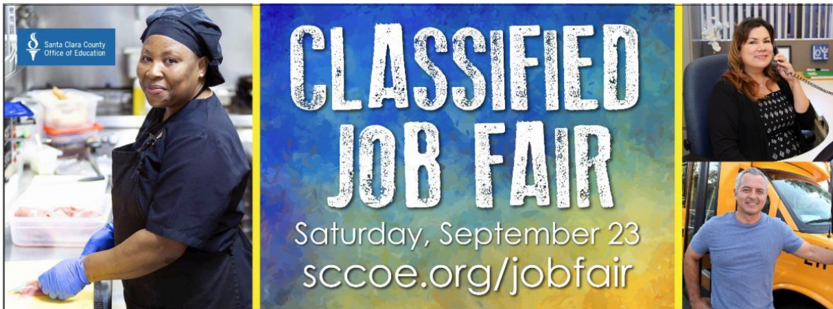
Classified Job Fair

The SCCOE's Annual Classified Job Fair will take place on September 23 from 9 a.m. to 12 p.m. at 1290 Ridder Park Drive, San Jose. This is an opportunity for candidates to meet with school districts to discuss current open classified positions, including: custodians, drivers, health clerks, maintenance workers, and more.