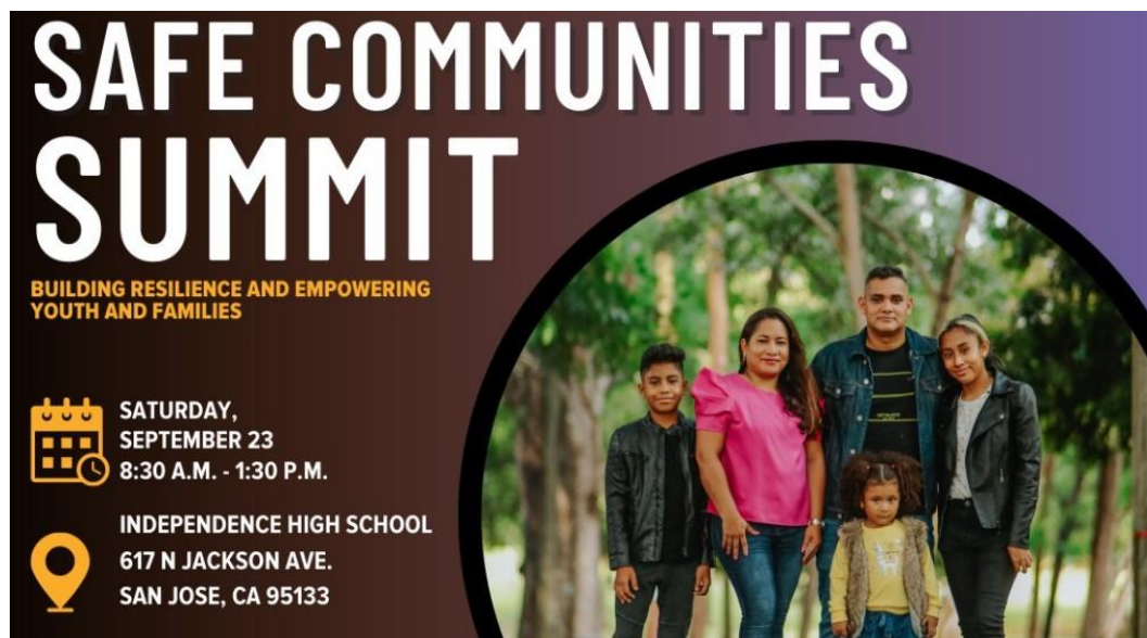
Annual Safe Communities Summit

If you're ready to volunteer and help students with homework, please fill out our online application form: https://scclid.org/volunteer/#sign