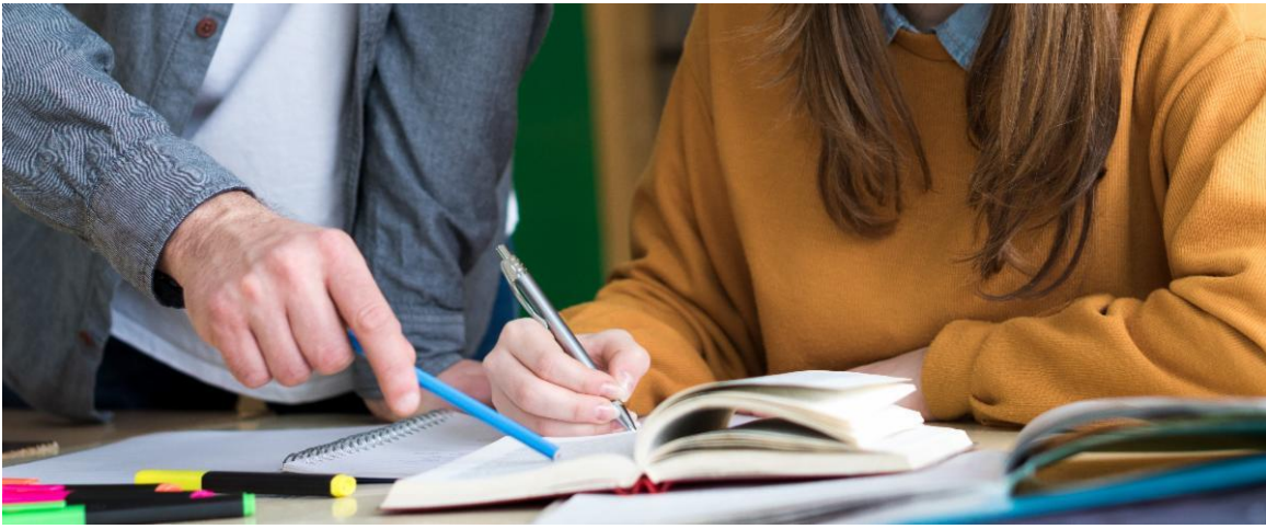
Santa Clara County Library District Volunteering

The Santa Clara County Library District is looking for volunteers who are willing to provide homework help to students in grades K-6 in the topics of Math, Science, and English. Volunteer tutors must be at least 14 years old, available at least one day (Monday-Thursday) from 4 – 5:30 p.m., and commit to a full semester. Adults will be background checked, and all tutors must attend required training.